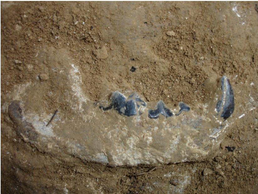
Detail of the right mandible of a wolverine from the bottom cultural layer at the Boršice-Chrástka site.