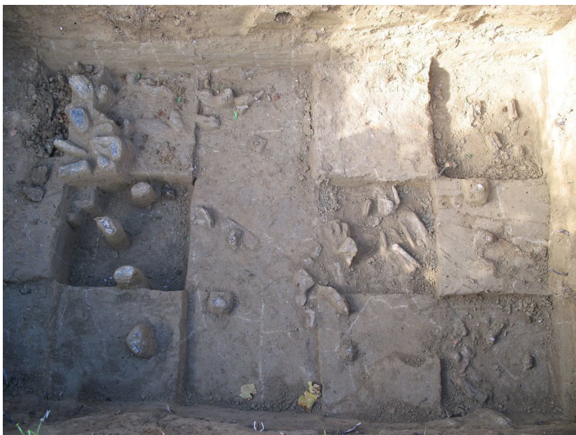
View of the uncovered area using a chessboard grid method by first excavating the odd and then the even fields; Boršice-Chrástka site.