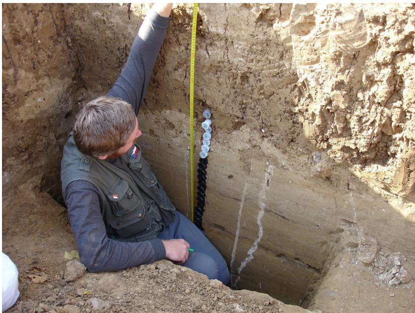
View of a trench section during the collection of sediment samples at the Boršice-Chrástka site.