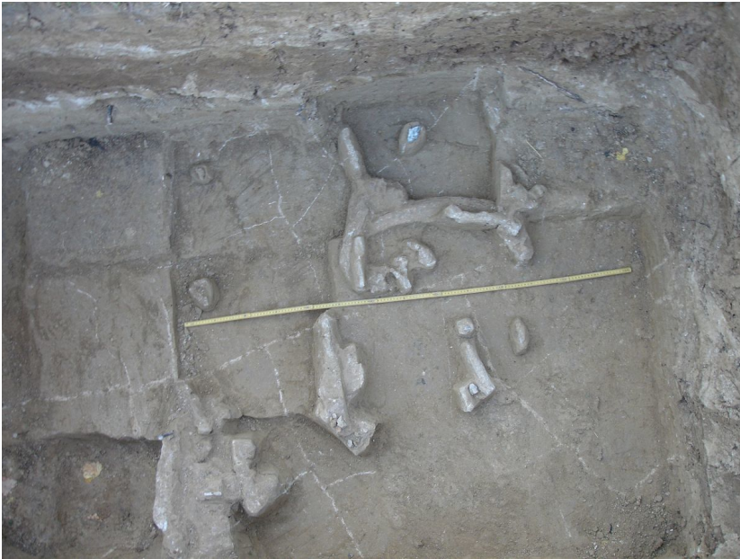
Overall view of the uncovered upper cultural layers at the Boršice-Chrástka site containing skeletal remains and chipped stone artefacts.