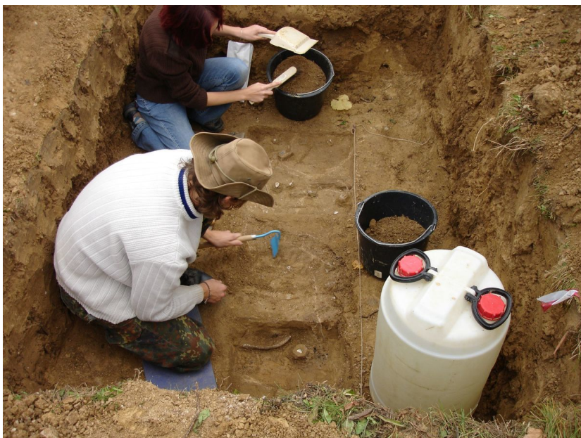
View of the archaeological fieldwork at the Boršice-Chrástka site.