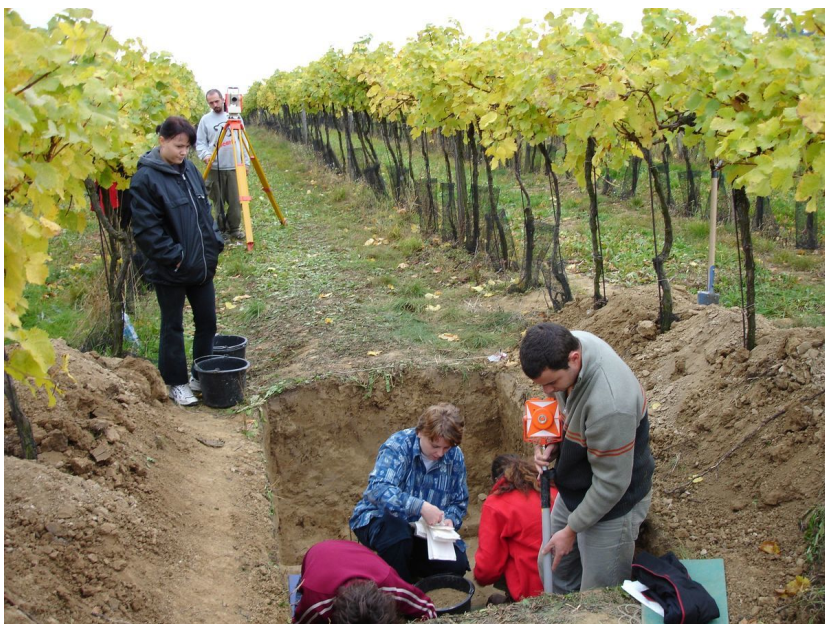
Archaeological fieldwork and the measurement of the position of the finds using a total station at the Boršice-Chrástka site.