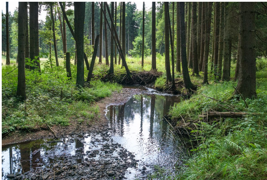
Závišínský stream with surrounding spoil heaps.