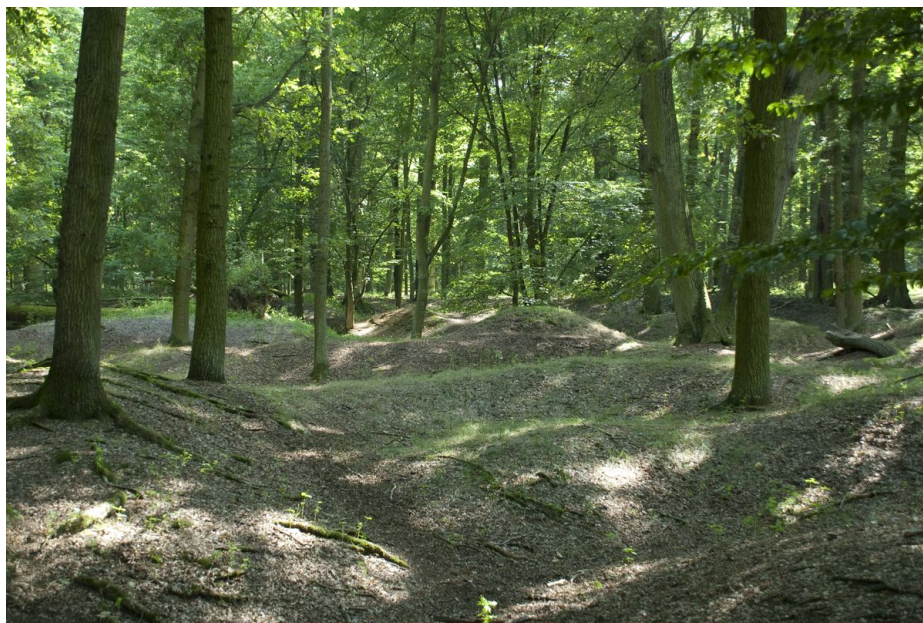
Spoil heaps in the chateau park.