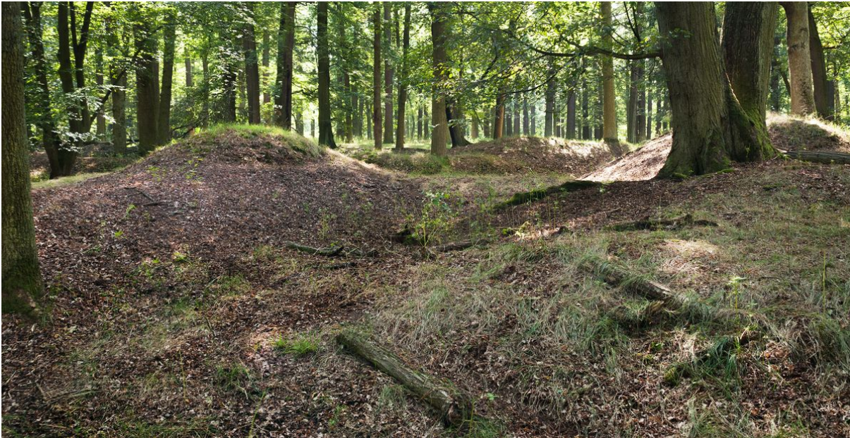
Spoil heaps in the chateau park.