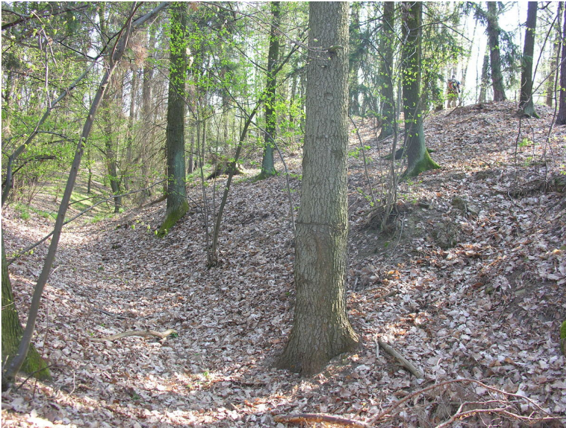
Rampart and inner ditch, view from the north.