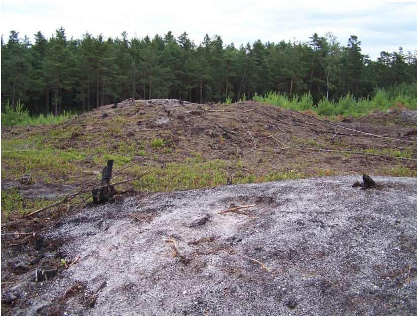
A barrow after forest fire.