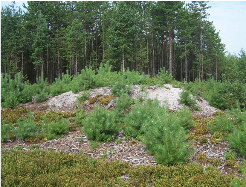
A barrow with renewed forest.