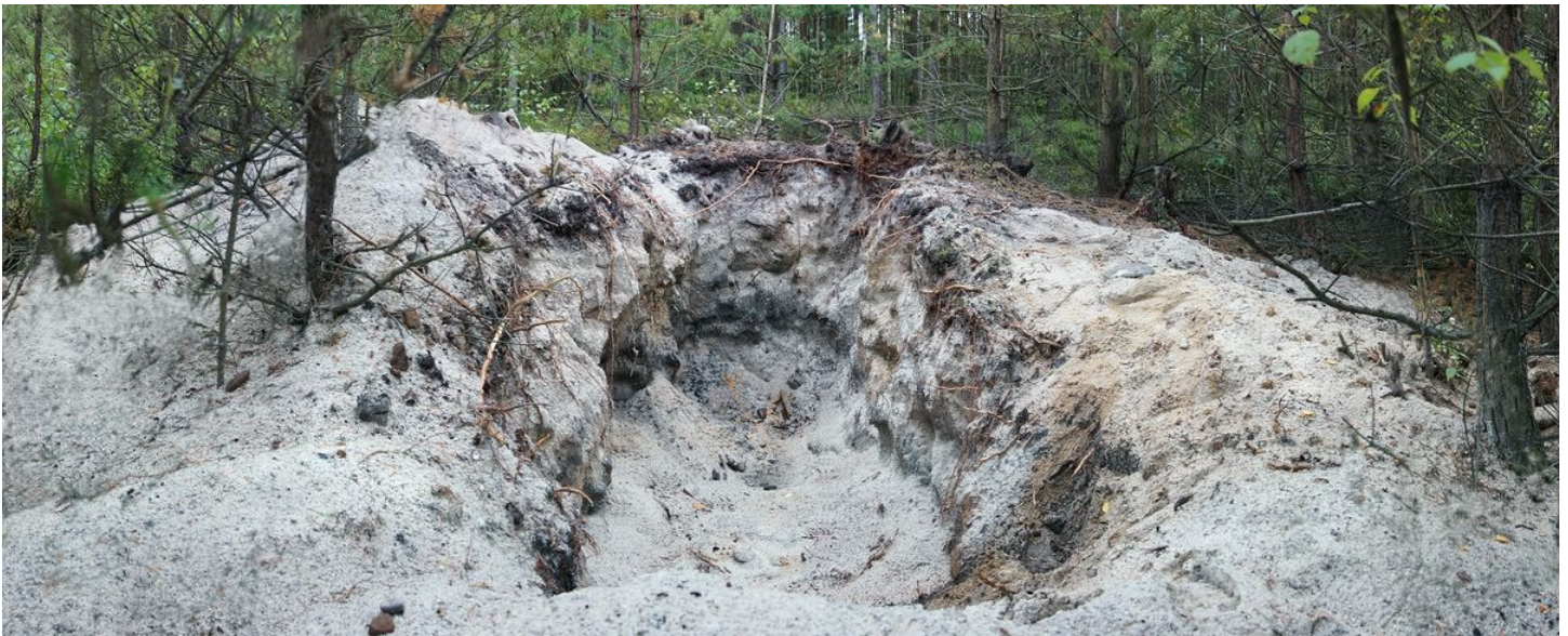
Barrow Nr. 28, destroyed by illegal excavations.