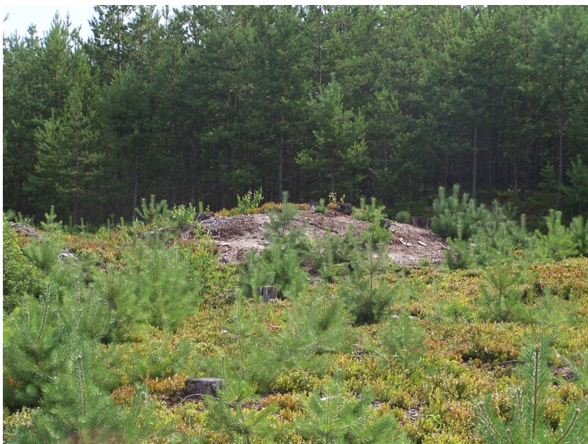
A barrow with renewed forest.