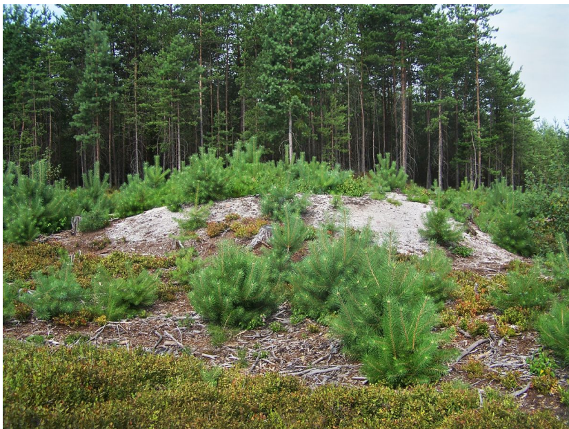
A barrow with renewed forest.