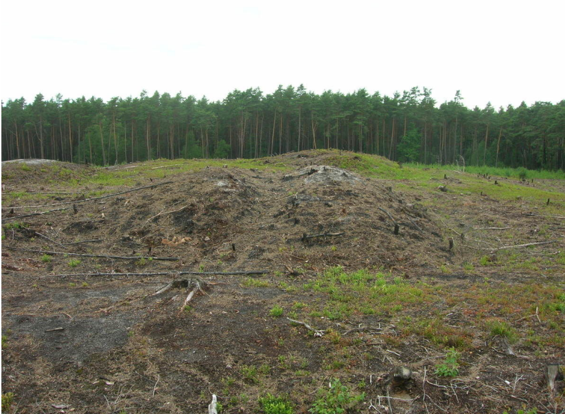
A barrow after forest fire.