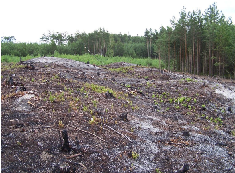
A barrow after forest fire.