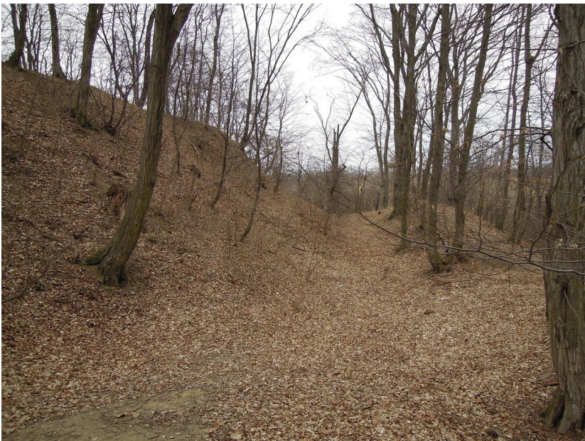
Settled hill of the small castle with ditch and outer rampart.