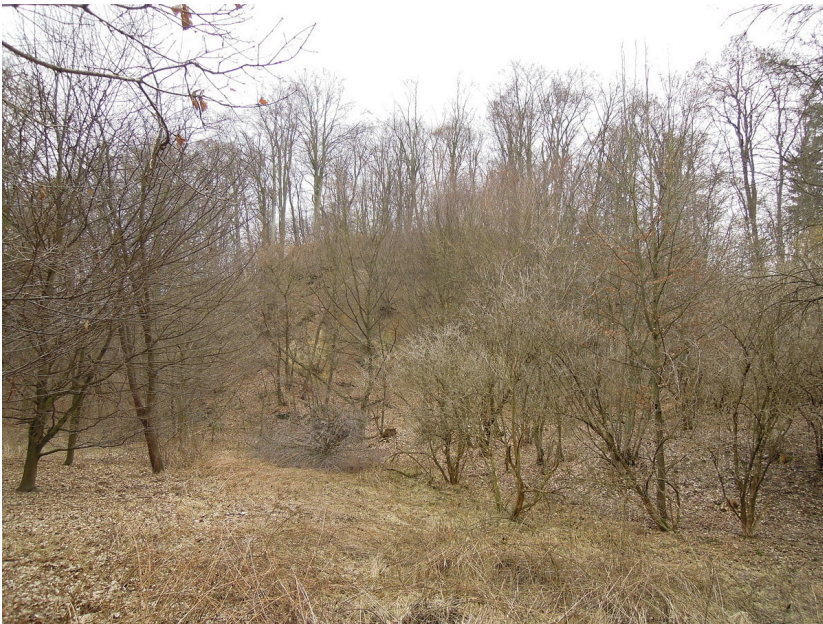
View of the site from the south.