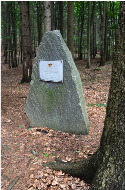
Memorial of the site of zemljanky.