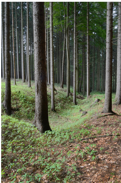
A hollow way near the sunken dwellings (the so-called dugouts).