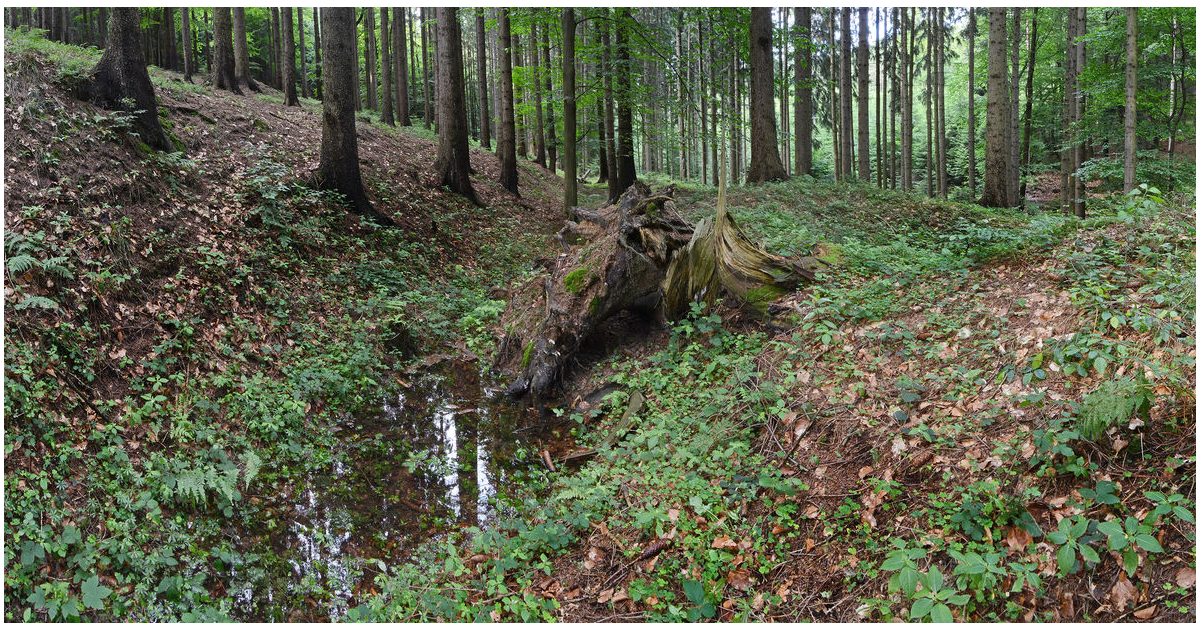
A hollow way near the sunken dwellings (the so-called dugouts).