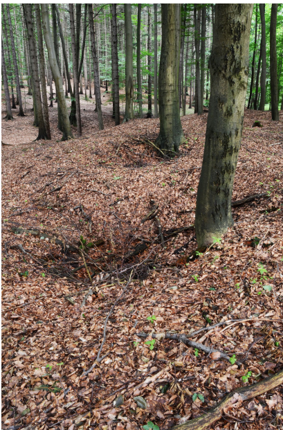
Other, less visible features.