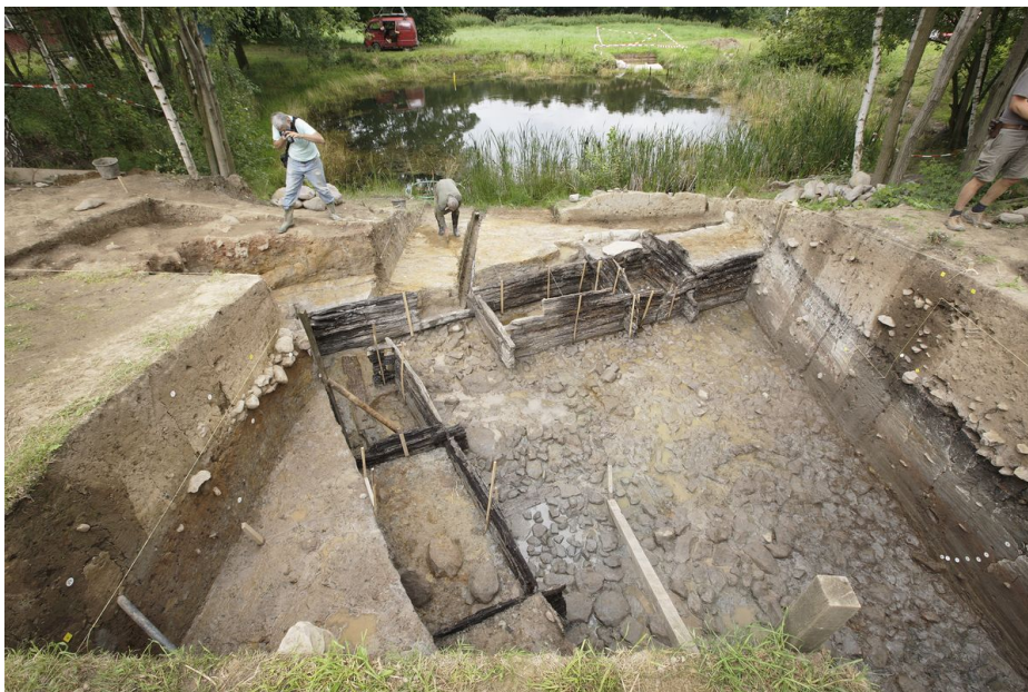
Water tank on the bailey in the course of archaeological field work.