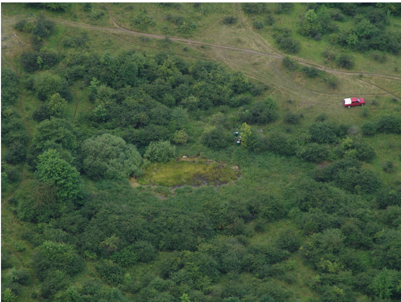
Pond on the acropolis during excavations in 2004.