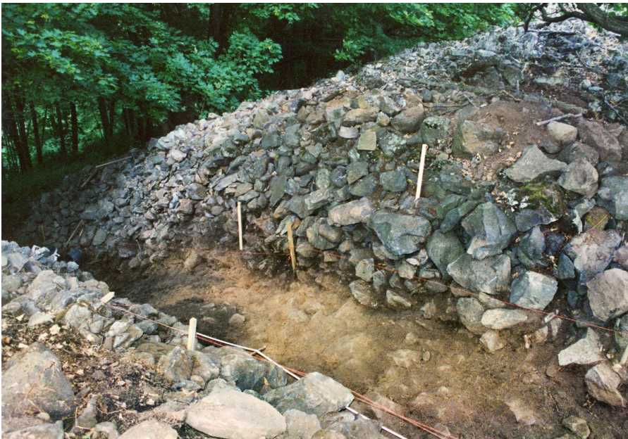
Cross-section of the inner stone bank on the acropolis.