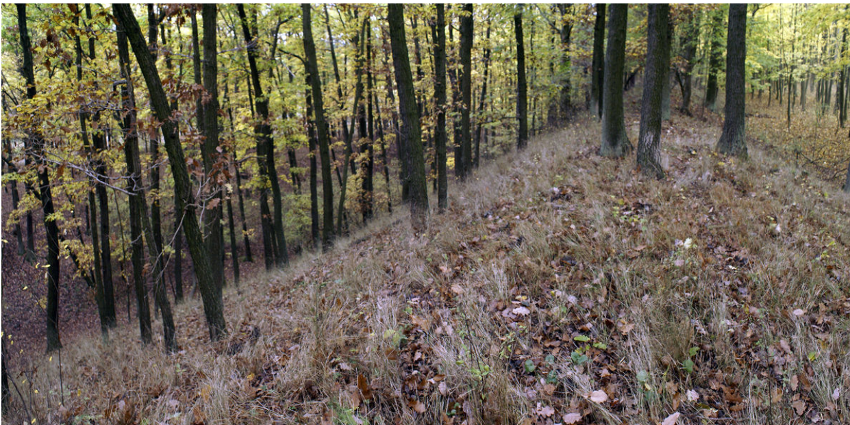
One of the inner banks at the hillfort Vladař.