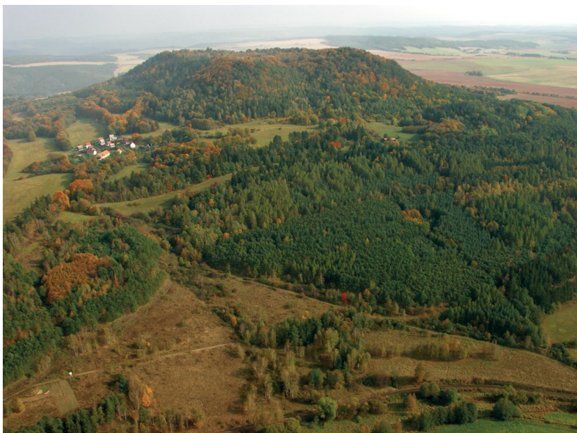
Aerial view of the Vladař Mt.