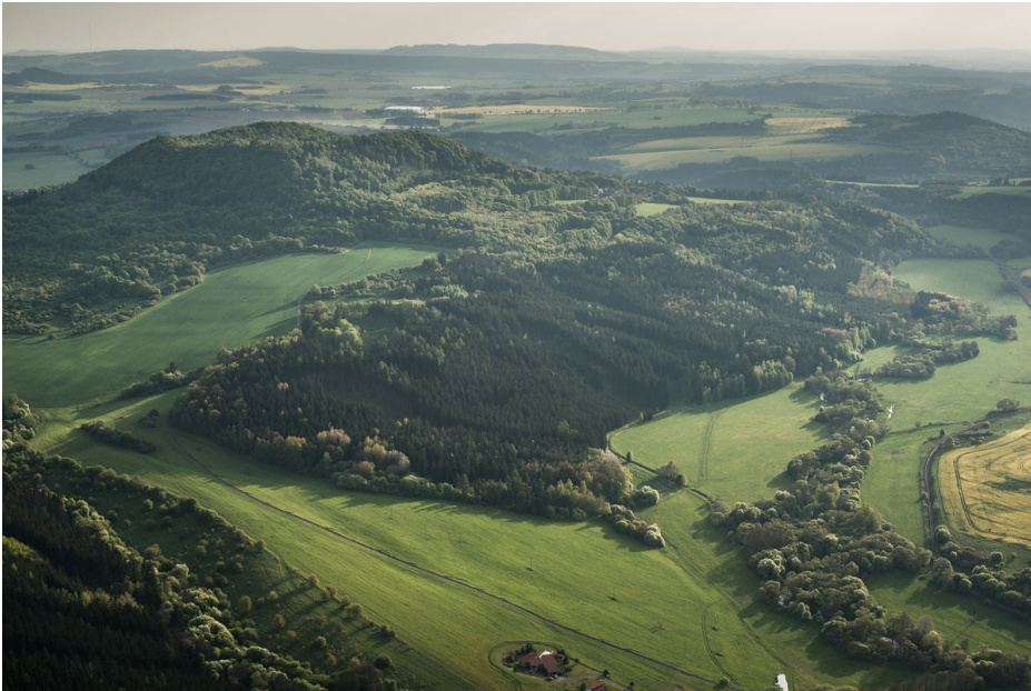
Vladař hillfort with extensive baileys.