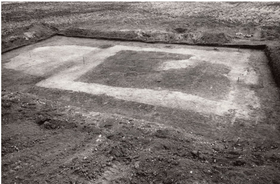
Ground plan of the church on the uncovered surface.