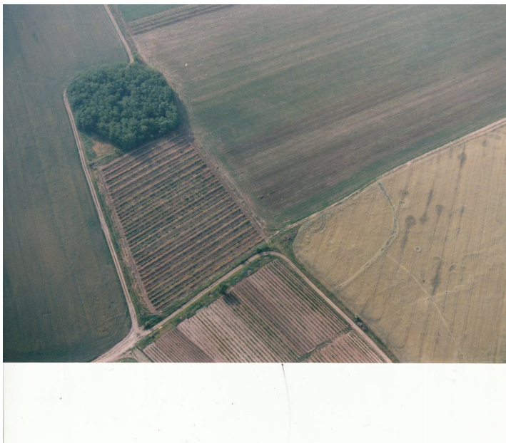
Aerial view of the deserted village of Koválov and the overgrown motte of Kulatý kopec.