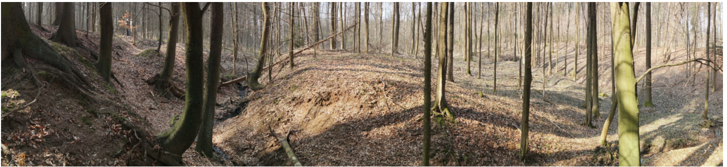
Pond bank with a visible millrace.