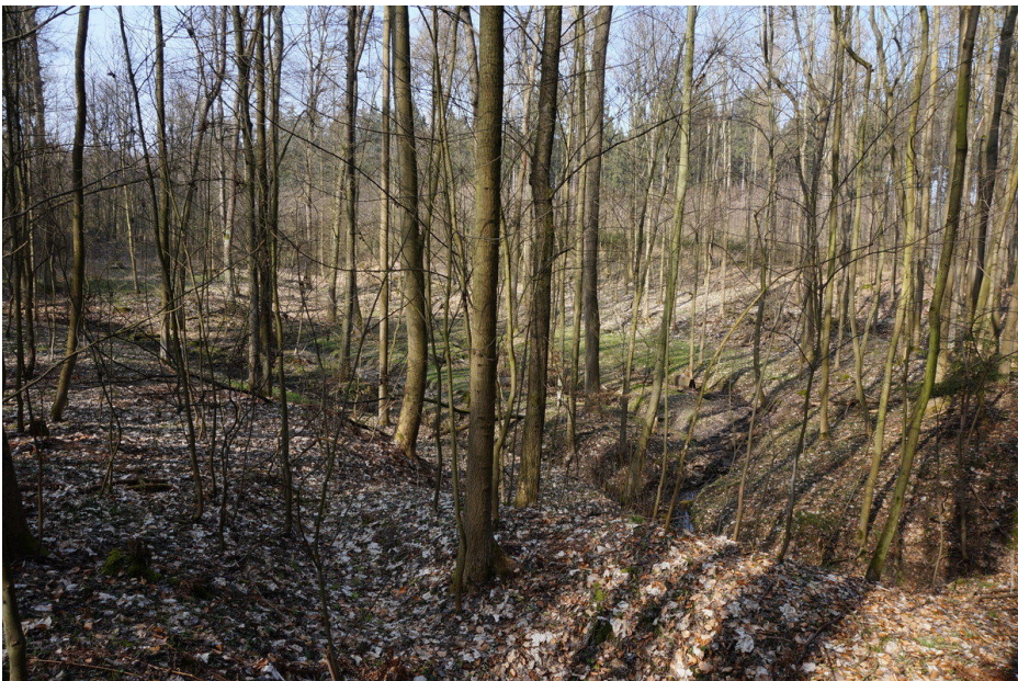
Spring basin, pond dam (left) with an overflow on south side.