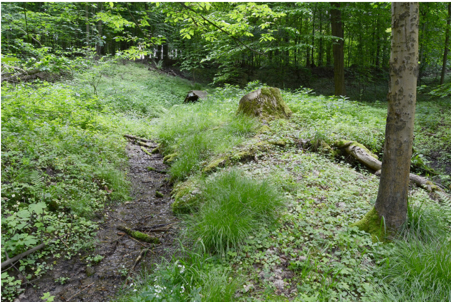
Spring basin, taken from west.