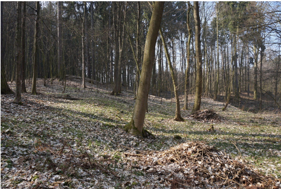
Surface relicts above eastern edge of the spring basin.