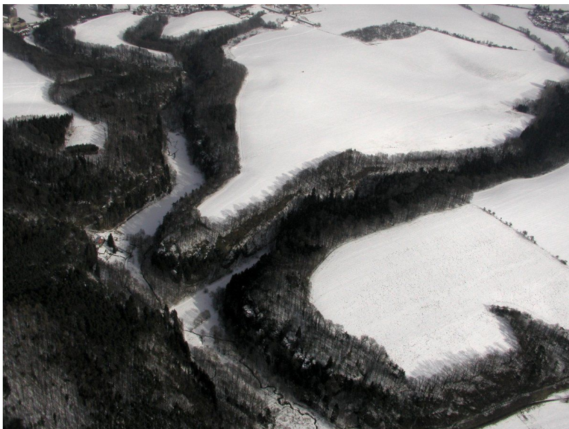
Aerial view of the hillfort Poráň.