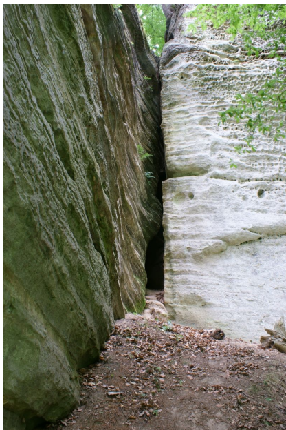
Entrance to the Knobloch-Skálova Cave.