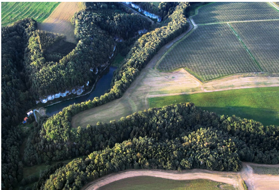
Aerial view of the hillfort with visible ditches.