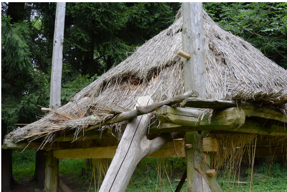
Hay barrack, roof construction in detail.