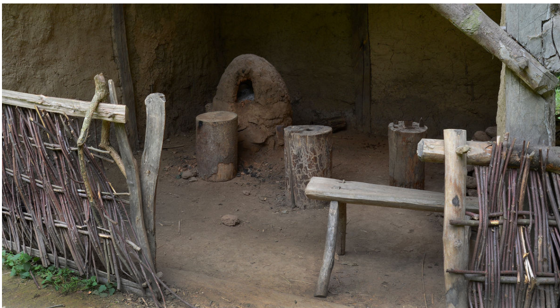
Reconstruction of a blacksmith's workshop and iron furnace.