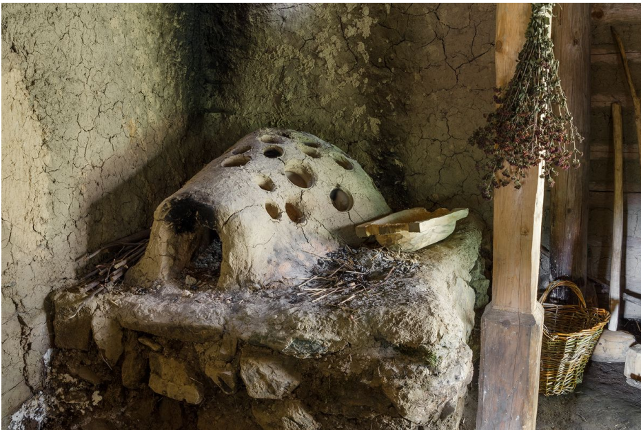
Heating facility of a house from Mstěnice.