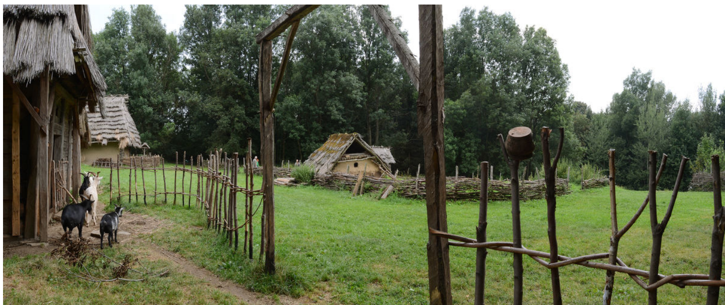
Open-air museum, taken from courtyard of a bi-partite house.