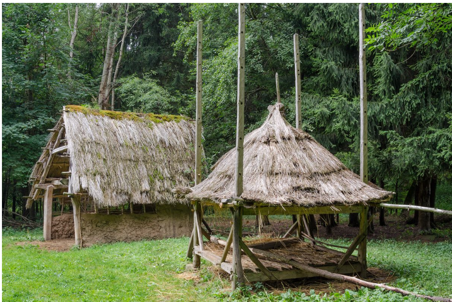
Hay barrack, a barn in the background.