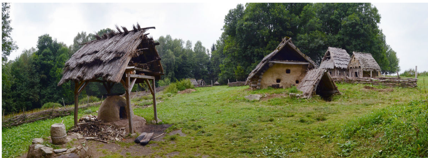
Panoramic picture of the open-air museum; reconstruction of a baker's oven and a corn mill in the foreground. Photo Z. Kačerová, 2014.