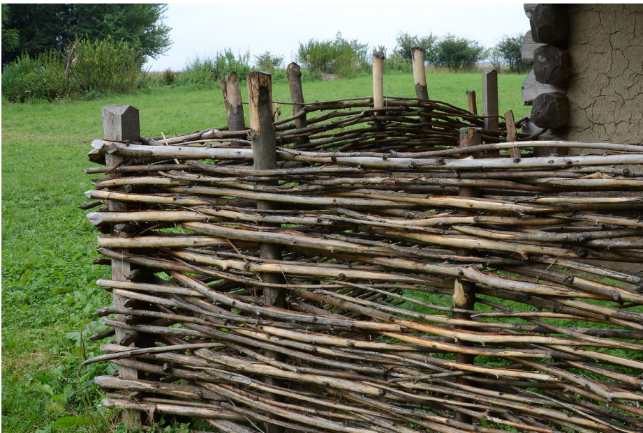
Detailed view of a wicker fence.