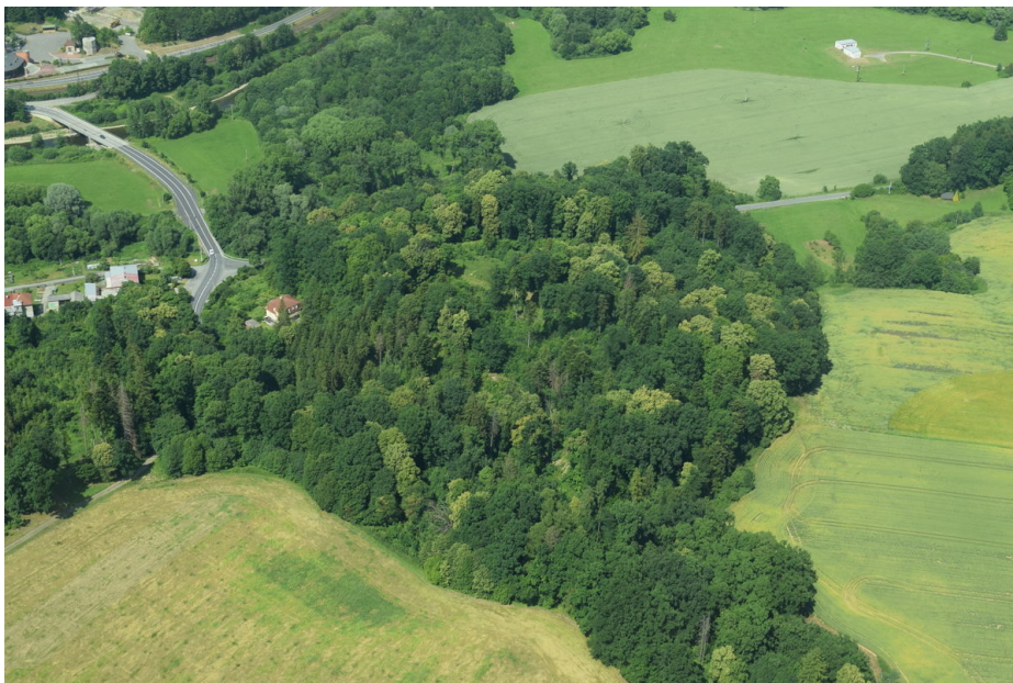
Aerial view of Hradištěk from the south.