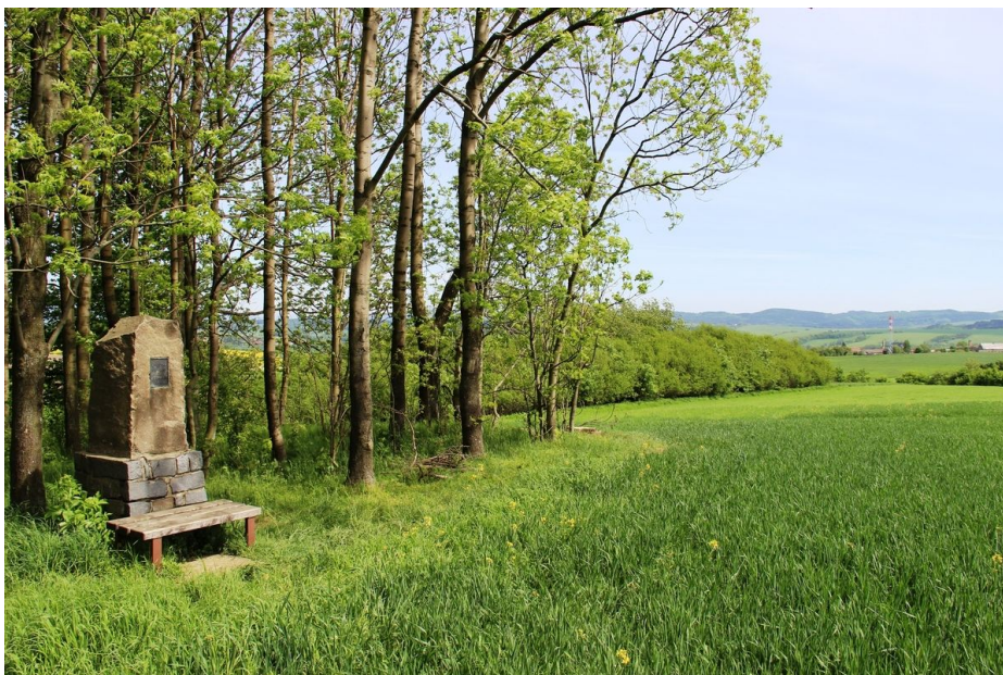
Peak of Strážný hill; memorial with a plaque commemorating the find of the Kelčov hoard in 1938.