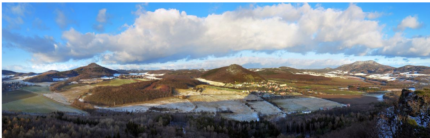
Panoramic picture of Třebušín region. Castle 'Panna' (left), Castle 'Kalich' (centre) and Castle 'Litýš' (right).