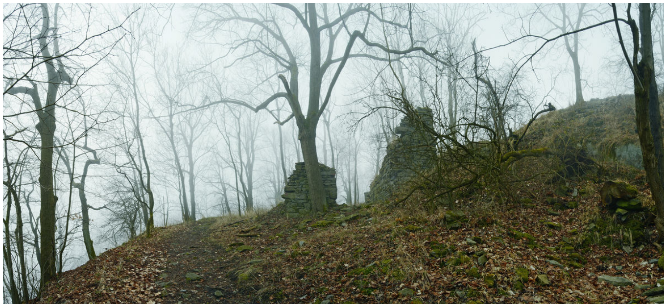
Fifth gateway - the entrance to the castle.