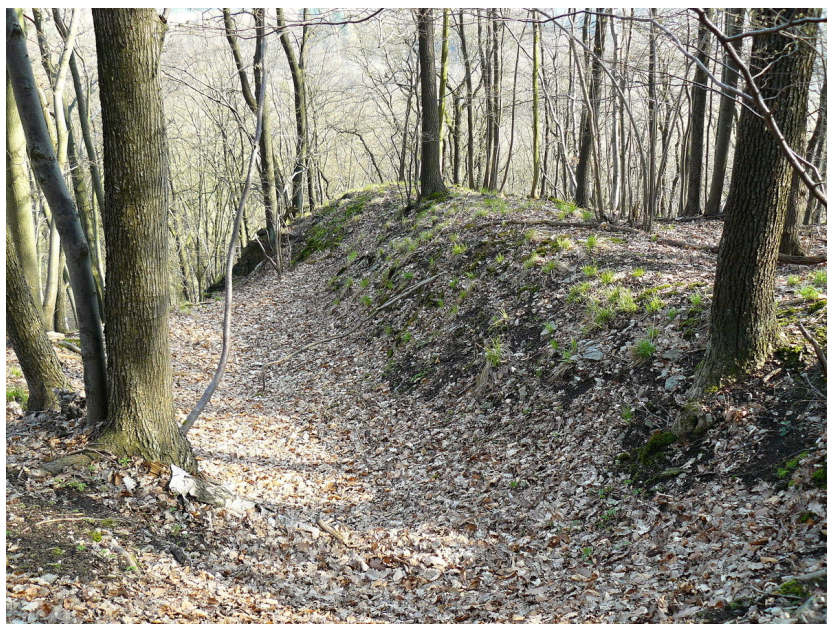
Bank fortification in the northern foreground of the castle.