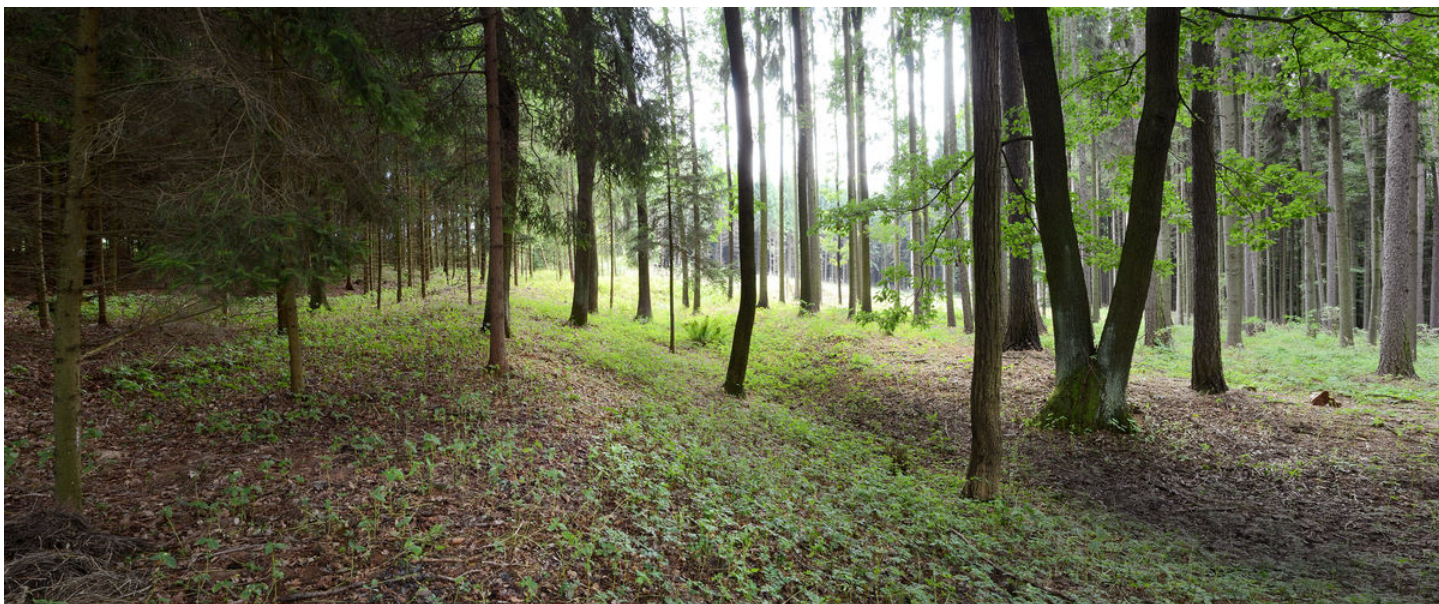
Several lines of banks.