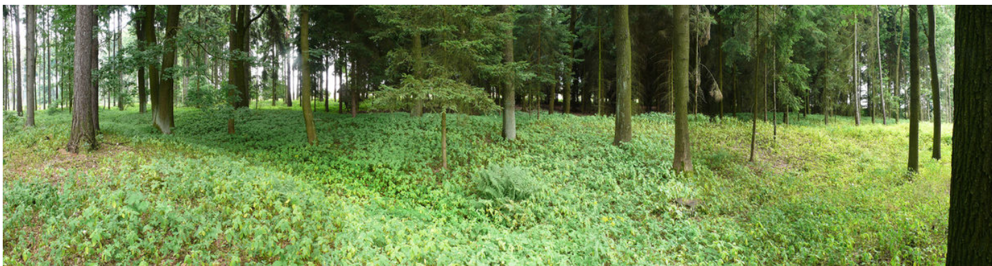
Banks of the circular area.