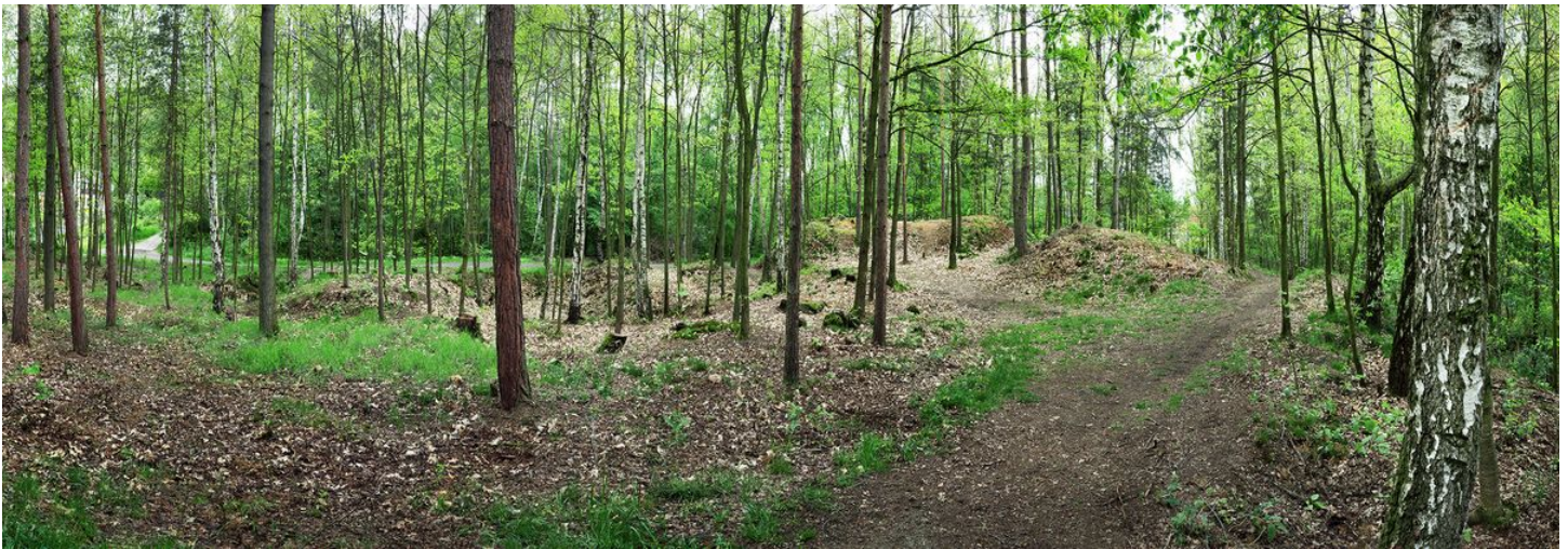
View from the acropolis on heavily damaged inner bank.