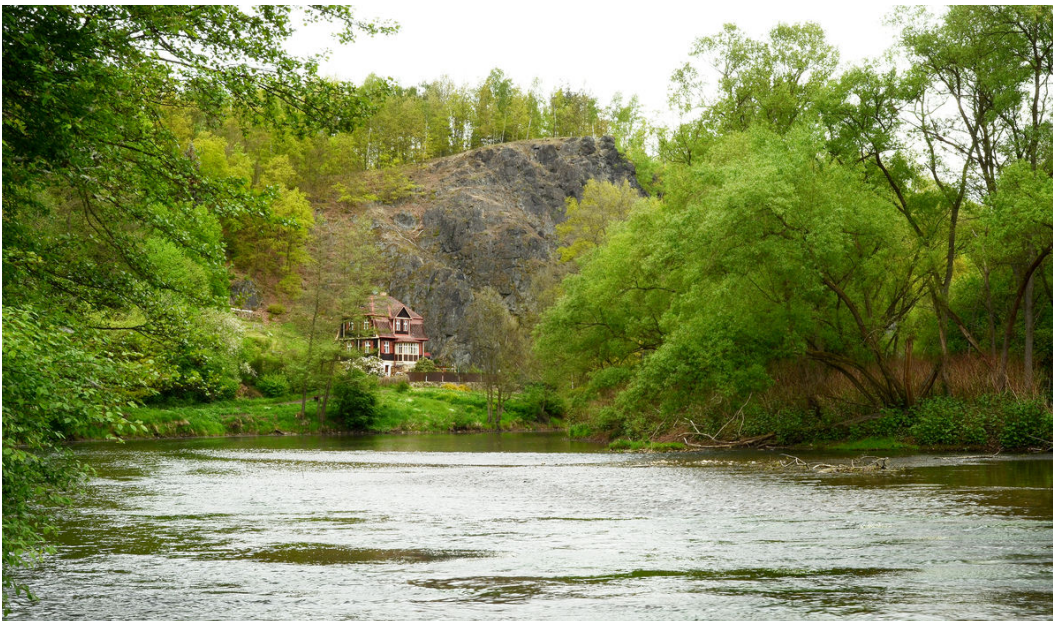
Rock outcrop, taken from river.