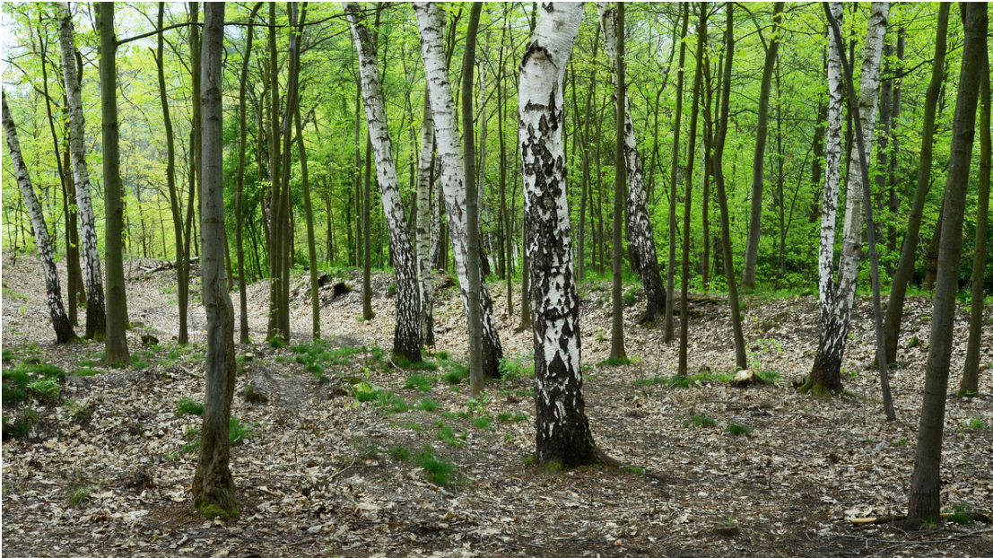
Well-preserved eastern side of the bank.