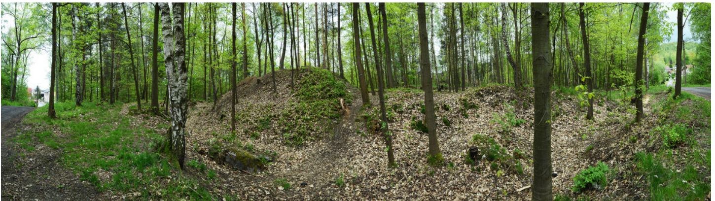
View from the bailey on the inner bank.