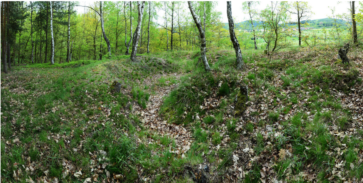
Sunken feature on the acropolis, probably remains of the church of Tašovice.