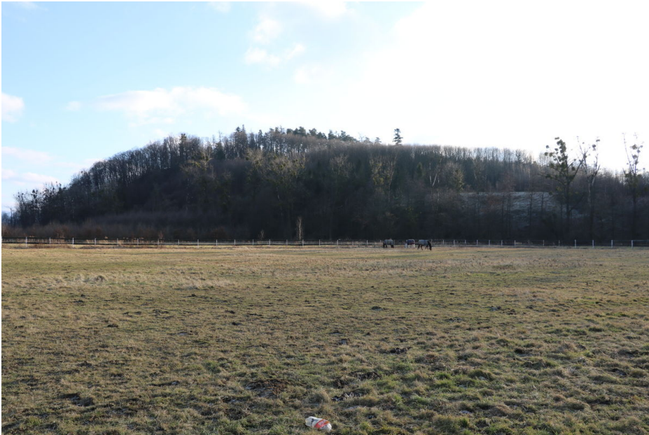
View of the site from the north-west.