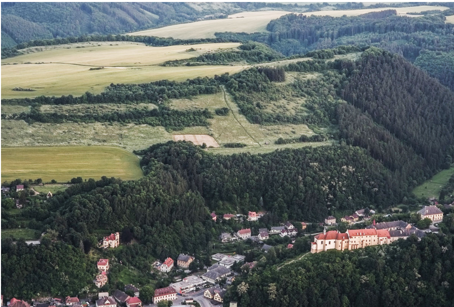
Aerial view of the chateau Nižbor (in foreground) and the oppidum Stradonice.