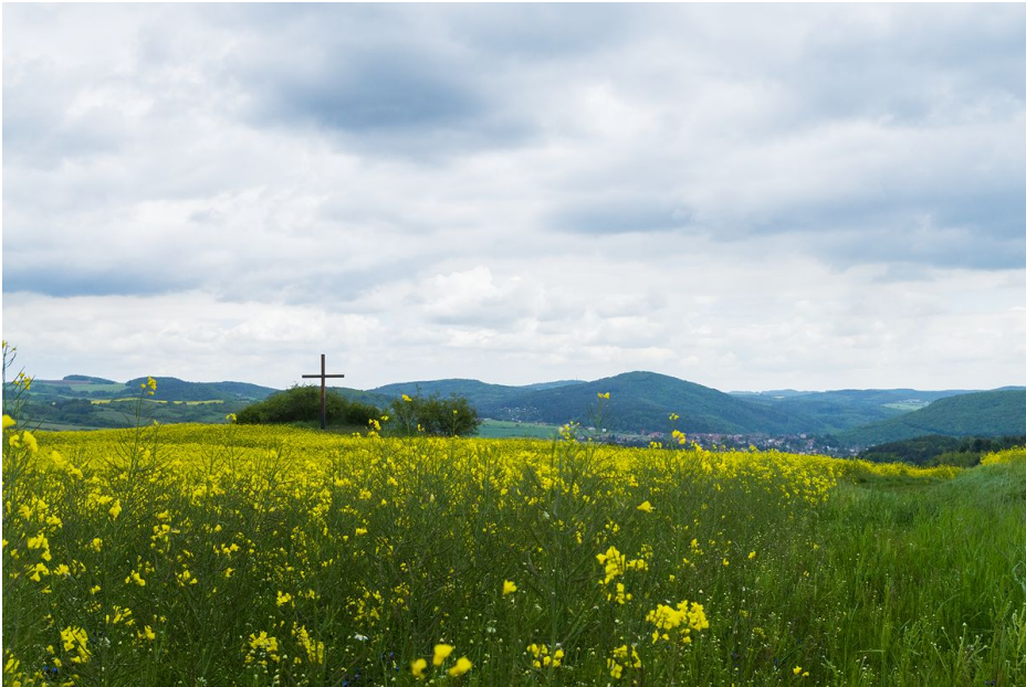
Hilltop of the Stradonice oppidum across a blooming meadow.