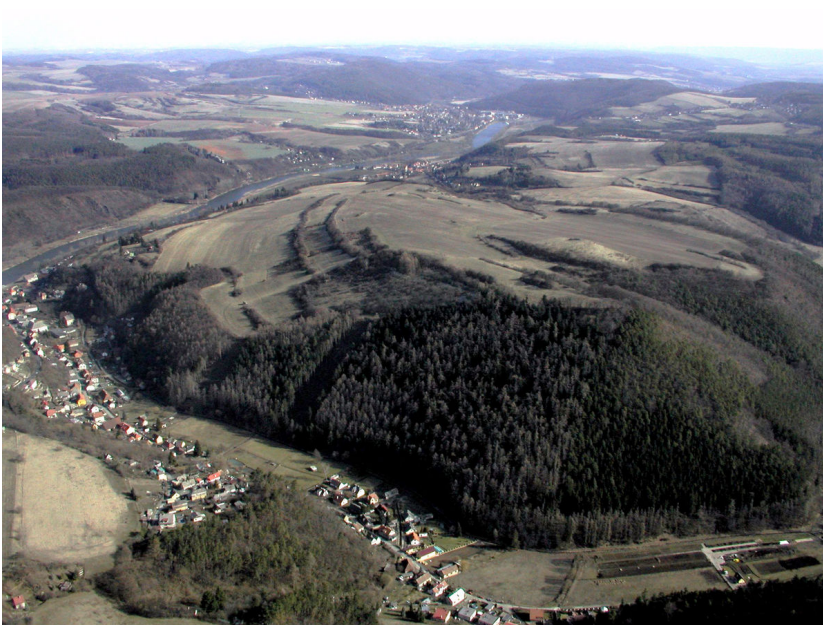
Aerial view of the oppidum.