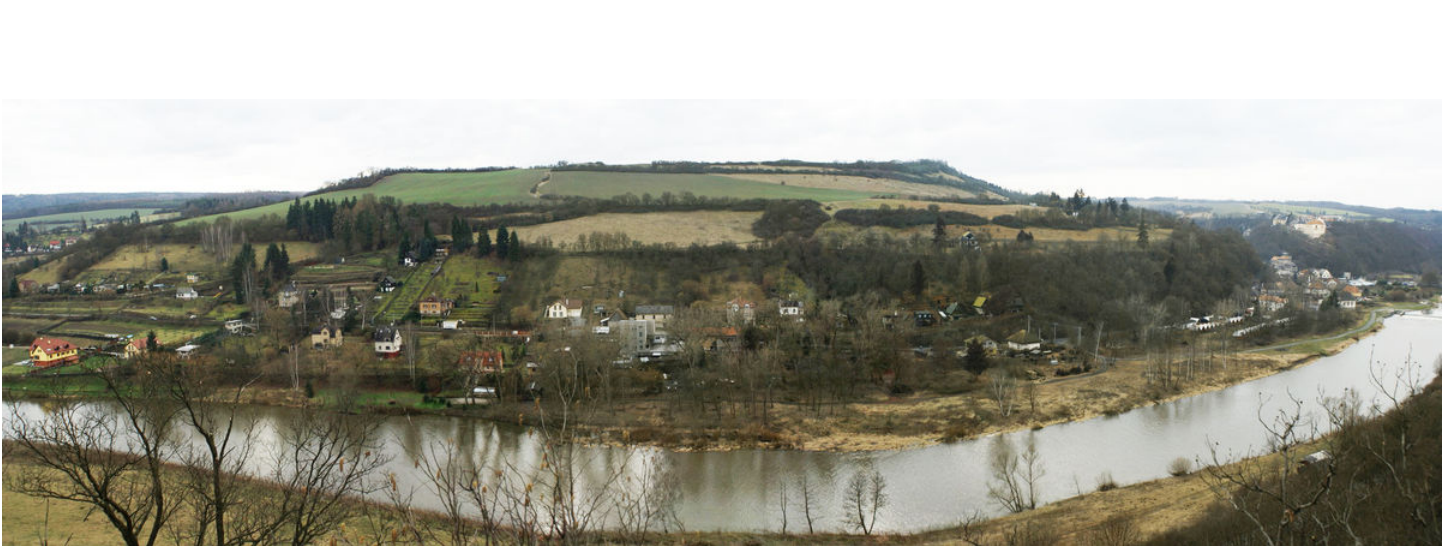
Oppidum Stradonice, taken from the left bank of Berounka river.