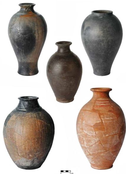
Finds of LaTene pottery from the oppidum at Stradonice.