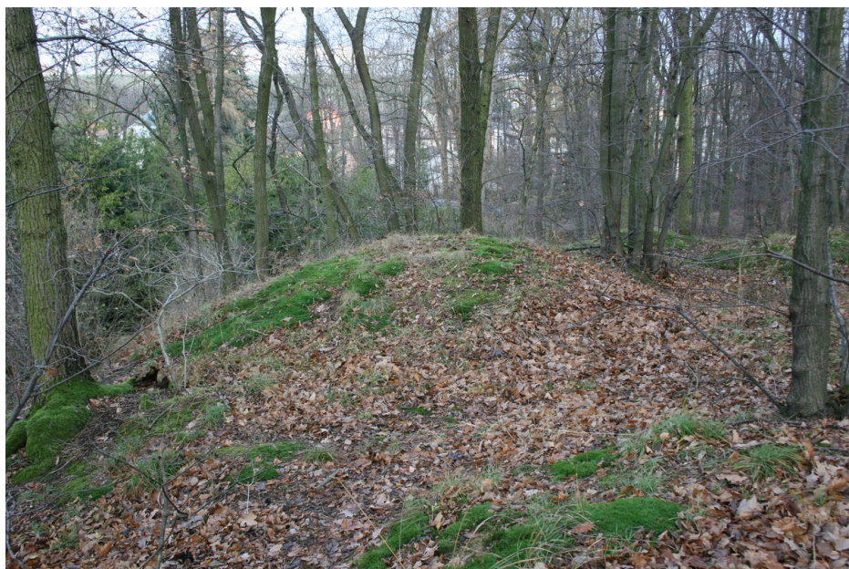
One of the barrows.