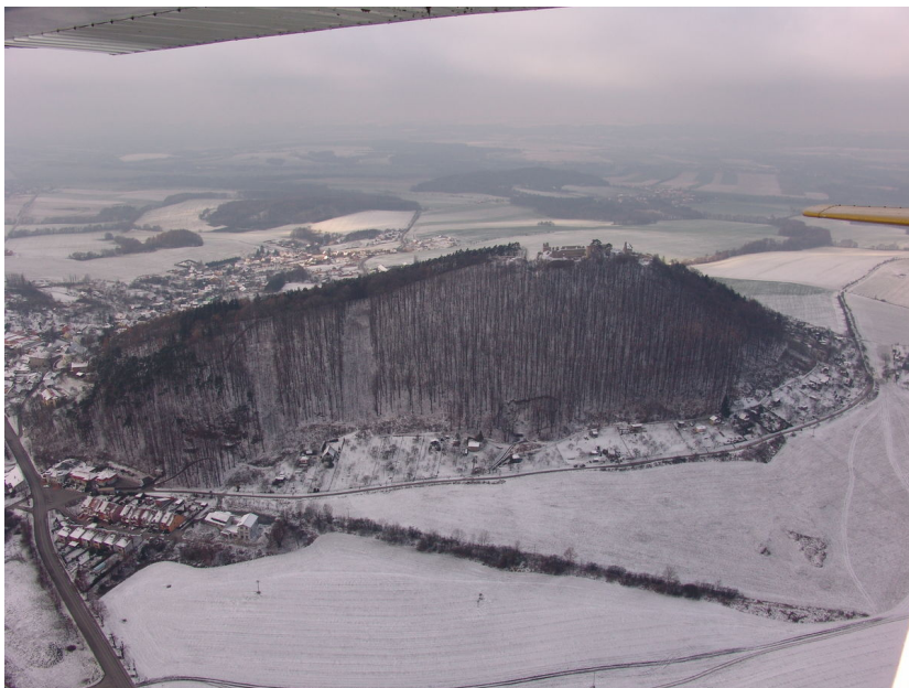
View from the east.