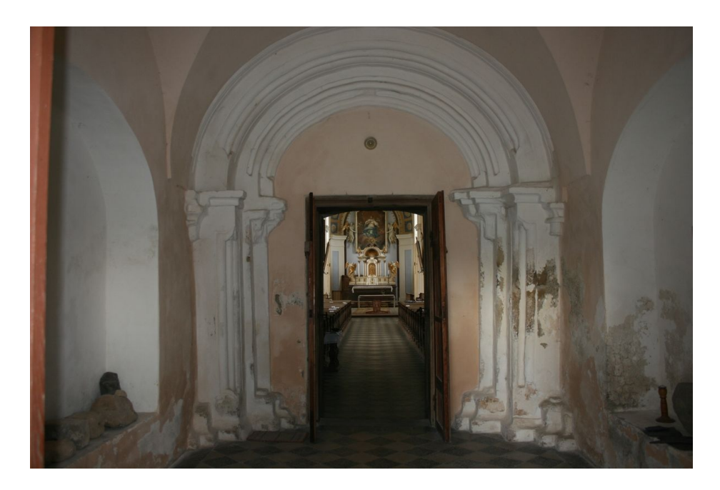
Church of the Immaculate Conception of the Virgin Mary, late Romanesque portal beneath the tower.