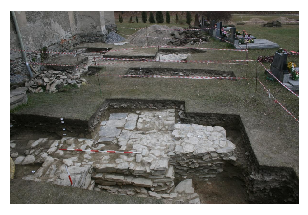
Church of the Immaculate Conception of the Virgin Mary, uncovered walls by the south wall of the presbytery during the excavation.