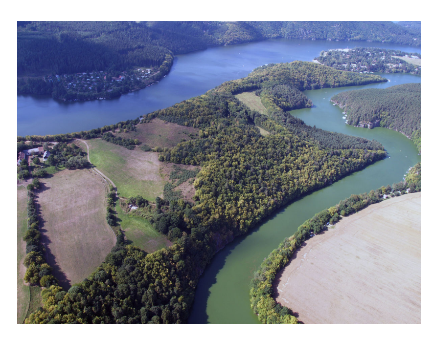
Aerial view of the hills Doubí (in the foreground) and Červenka.