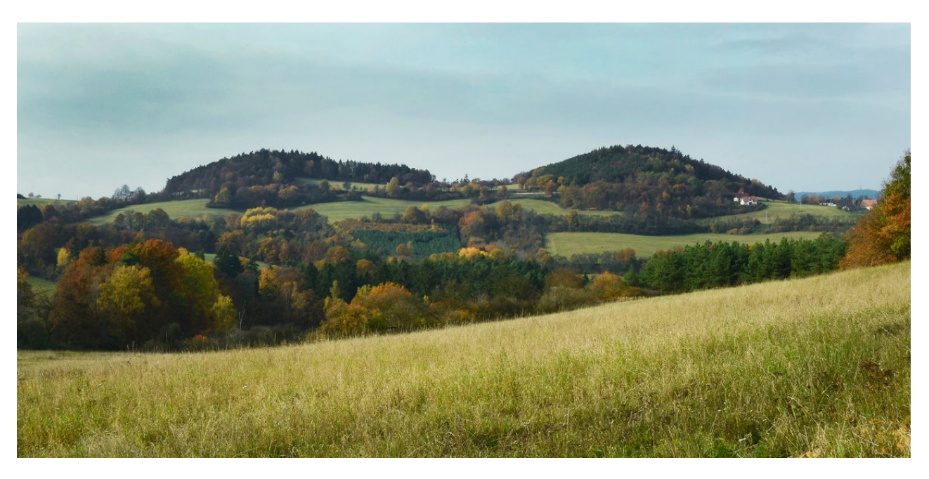
Hilltops Doubí (left) and Červenka from east.