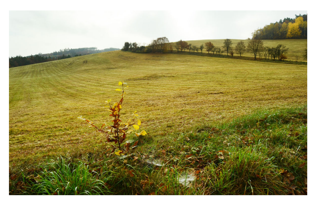
Inner area of the oppidum. Photo Z. Kačerová, 2013.