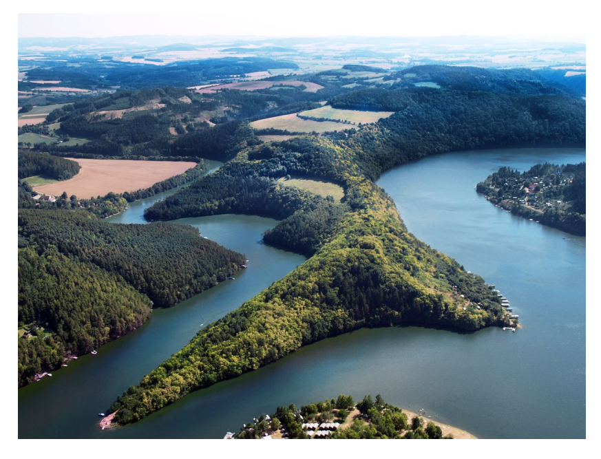
Aerial view of the promontory with oppidum, taken from north. Photo ÚAPPSČ Prague, 2004.