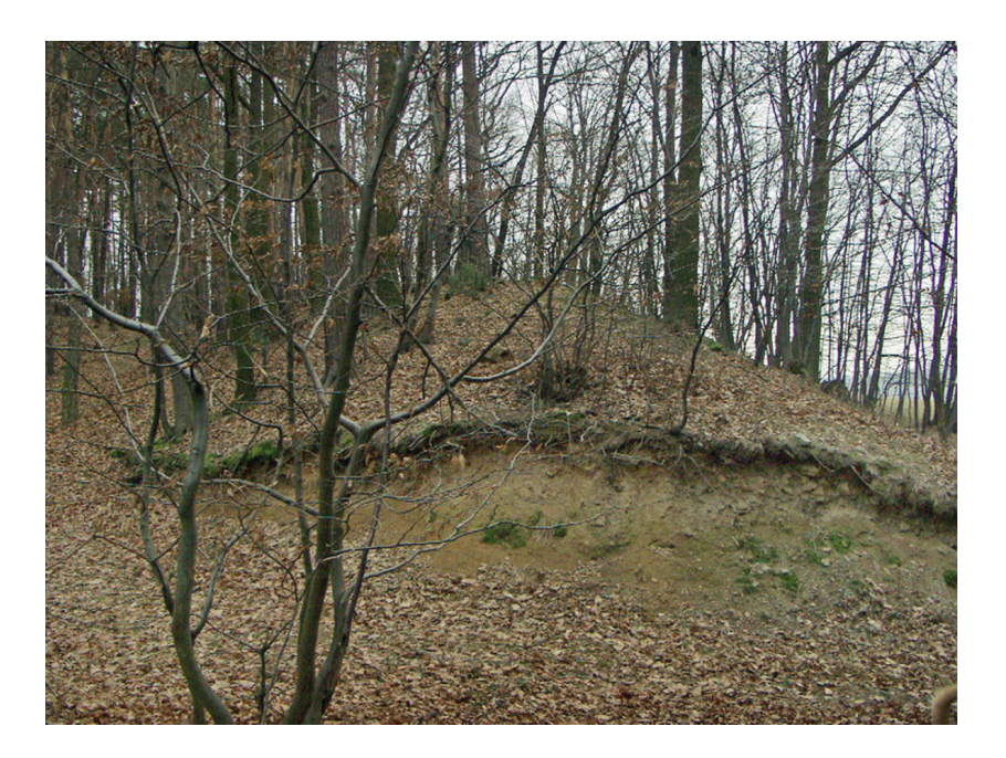
View of the interupted bank at the hill Doubí.