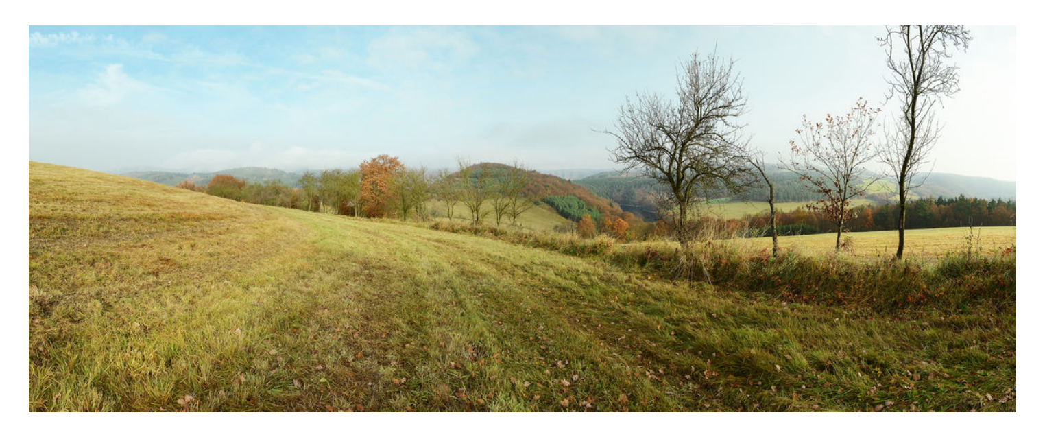
View of the oppidum's top, taken from southwest.