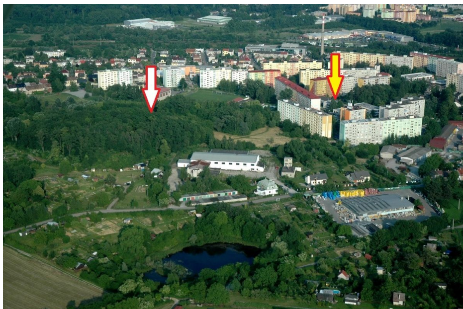
Camp of the mammoth hunters in Předmostí near Přerov, covered with modern prefabricated housing.