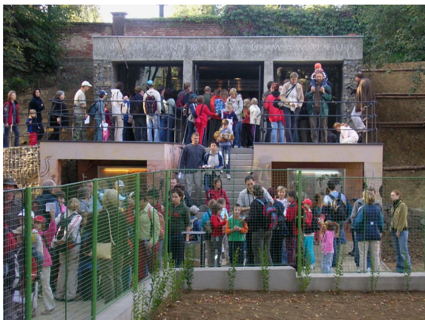
Ceremonial opening of the Mammoth Hunters' Memorial on 7 October 2006.