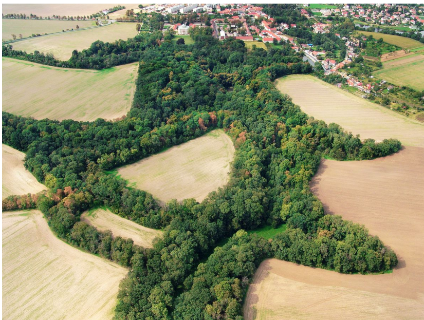
Aerial view of the site.