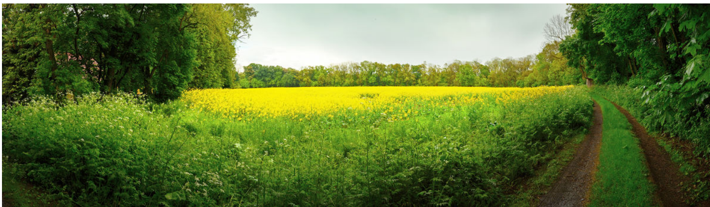
Hillfort in summer.