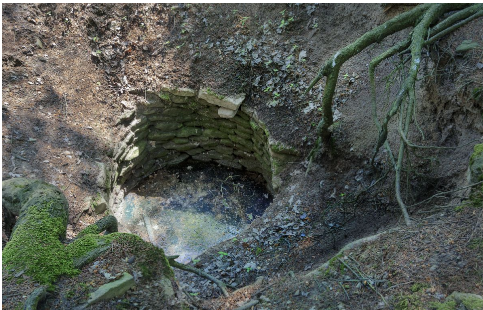
One of two preserved Medieval wells.