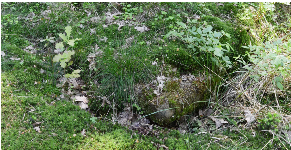
Corner stone of the village mayor's house.