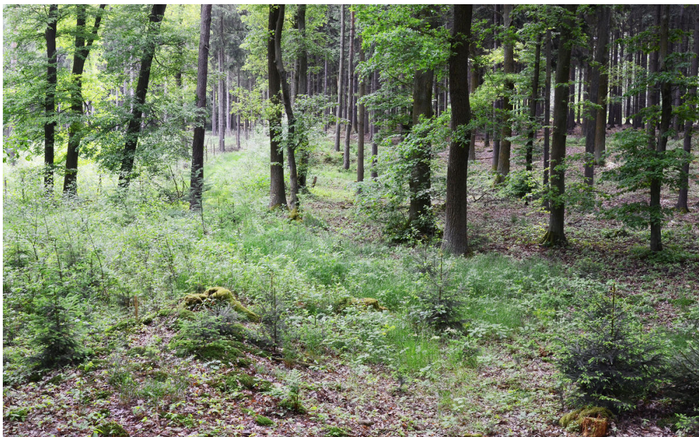
View of the former village square.