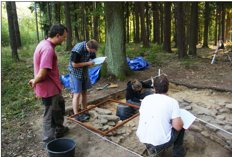
Archaeological field works.