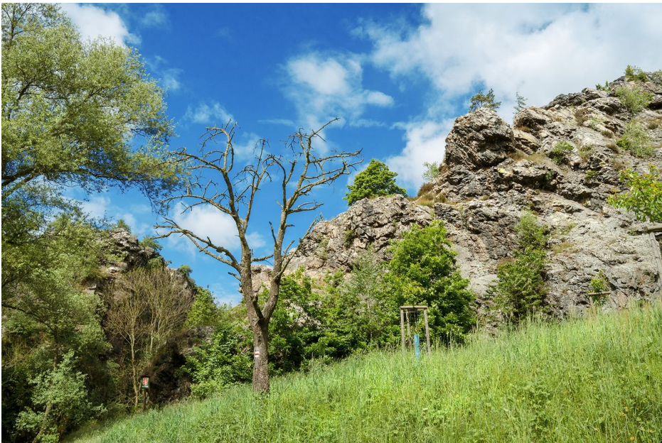
Gorge of the Libocký Stream between Šestákova (left) and Kozákova Rock.