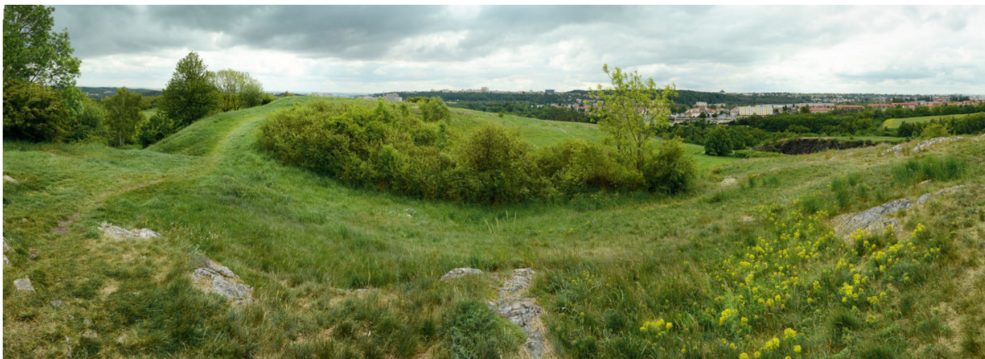
Area of the previous gate located in northern part of the acropolis.