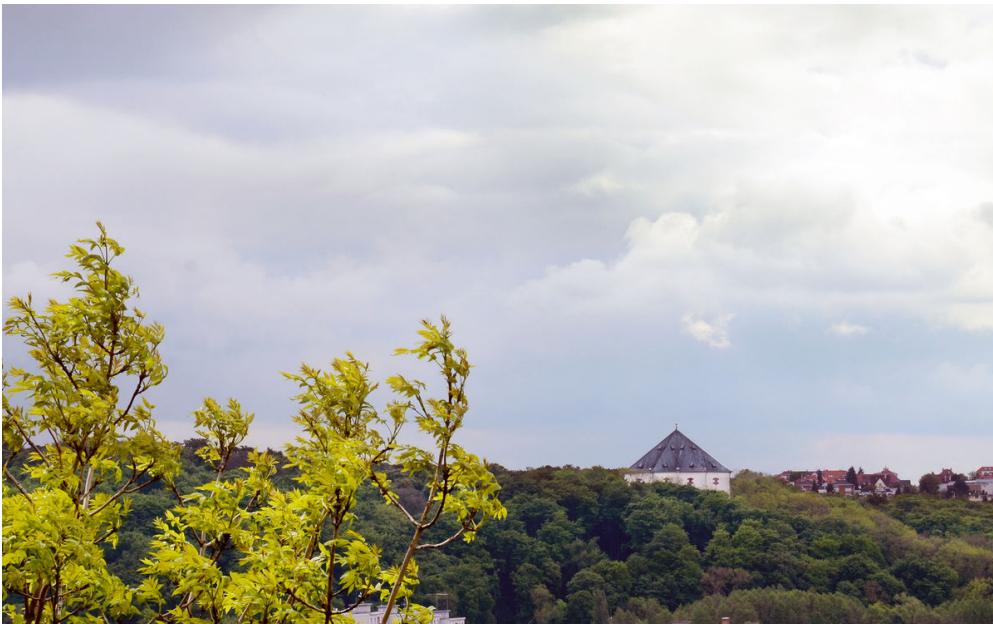
View of the Renaissance Summer Residence Hvězda.