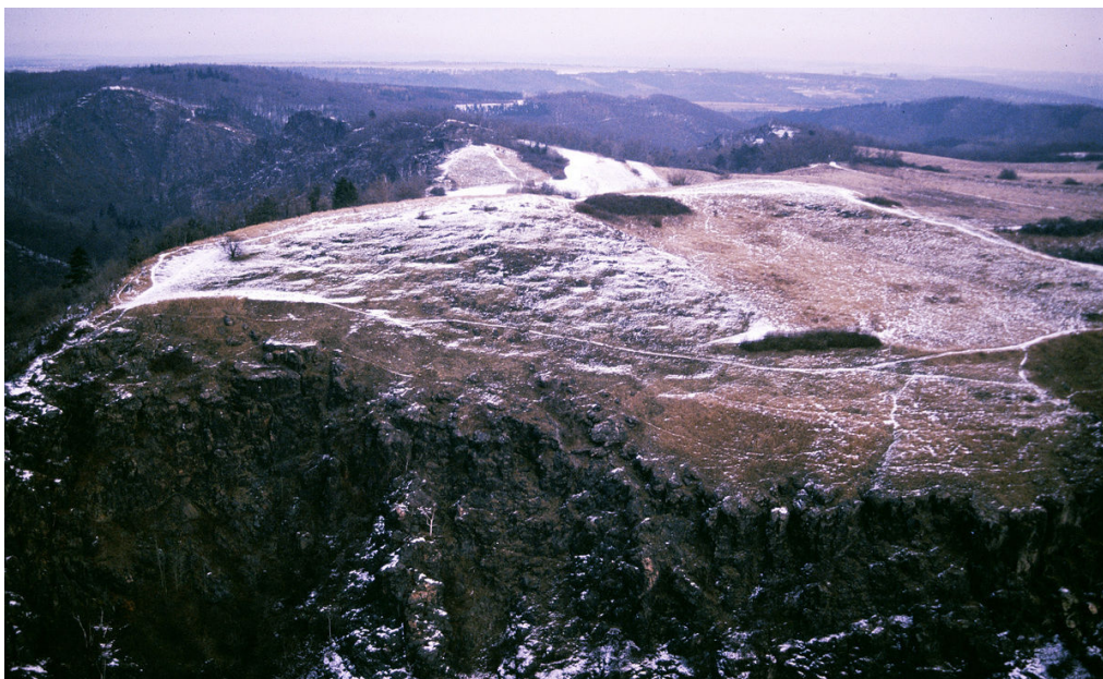
Winter aerial view of the acropolis and the first bailey.