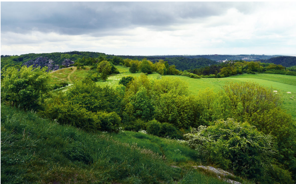
View from the acropolis towards 'Dívčí Skok' rock. 2014.