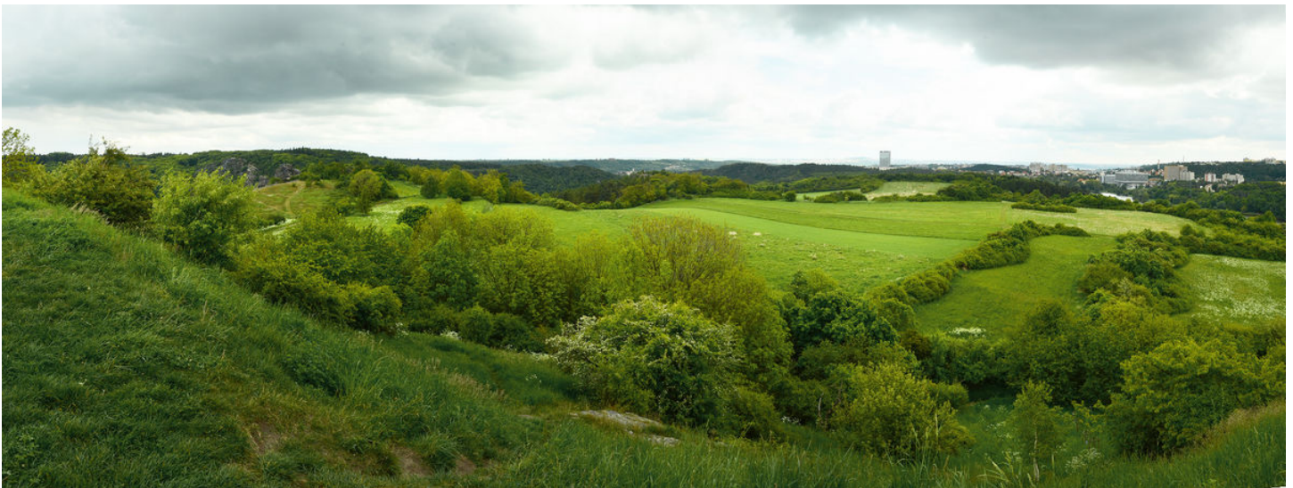
View from the acropolis on extensive inner and outer baileys.