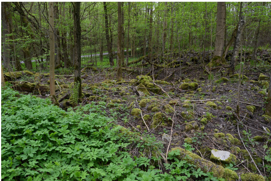
Remains of the former fortified manor.