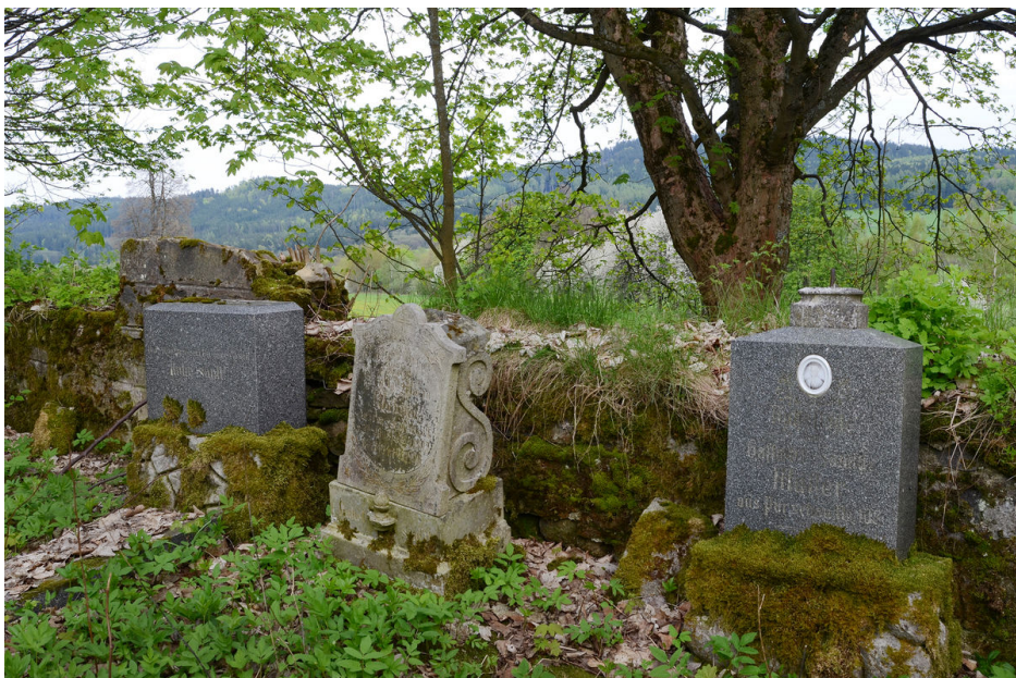
Cemetery at the St. Anna church.