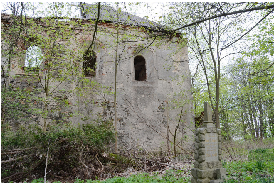
St Anna church.