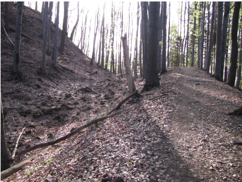
Circular ditch and earthwork of the upper ward; northern part, seen from the east.