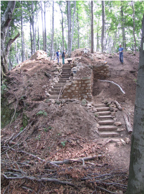
Gateway on the south-western side of the upper ward during the reconstruction; view from the south-east.