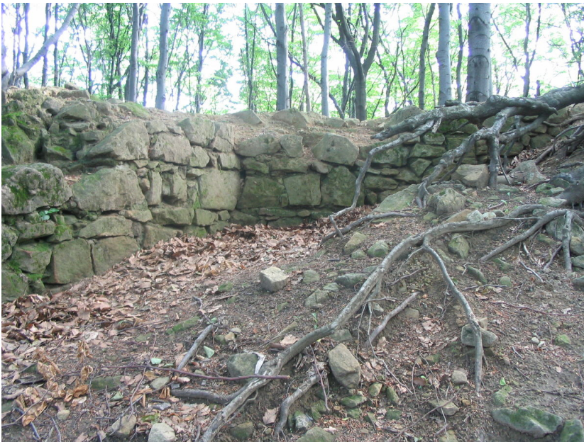
Inner corner of the curtain wall of the upper ward; seen from the south.