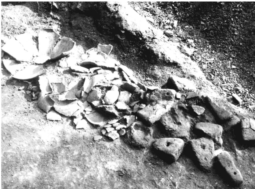
Finds from a house Nr. IV. V. Klein's sxcavations (1934).