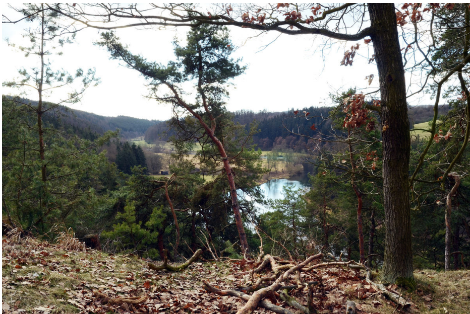
View from the hillfort across the Berounka valley.