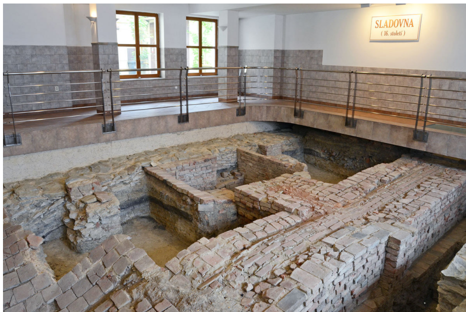
Unearthed foundations of the 16th century malthouse in basement of the municipal office.