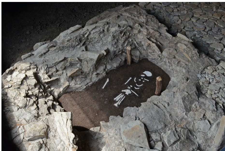
Unearthed stone construction of the barrow with a burial chamber and part of the access ramp.