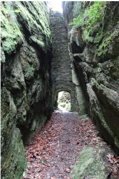
Small gate on the outer side of a rocky gorge.