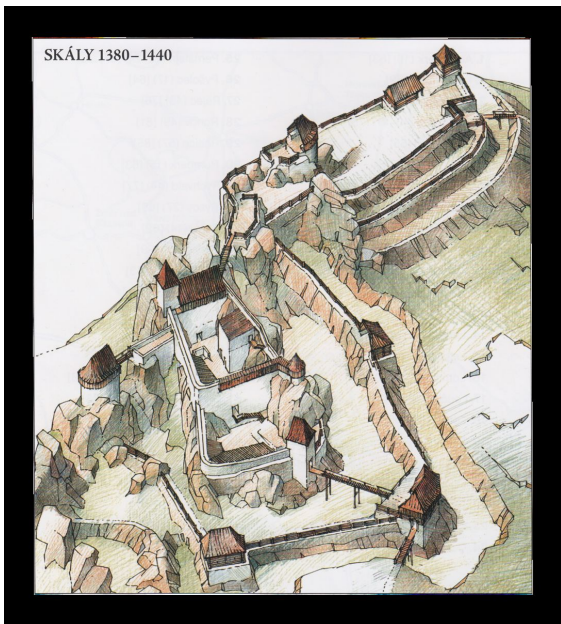
Reconstruction of the appearance of Skály castle in 1380-1440.