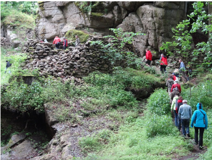
Archaeological field trip to Skály castle.