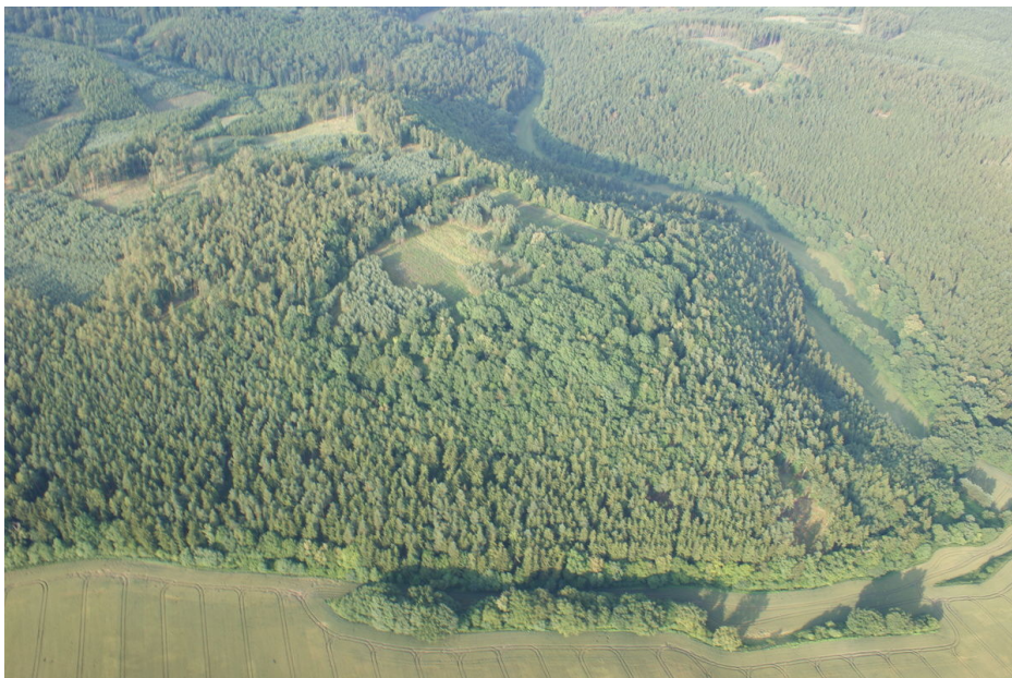
Aerial view of the site.