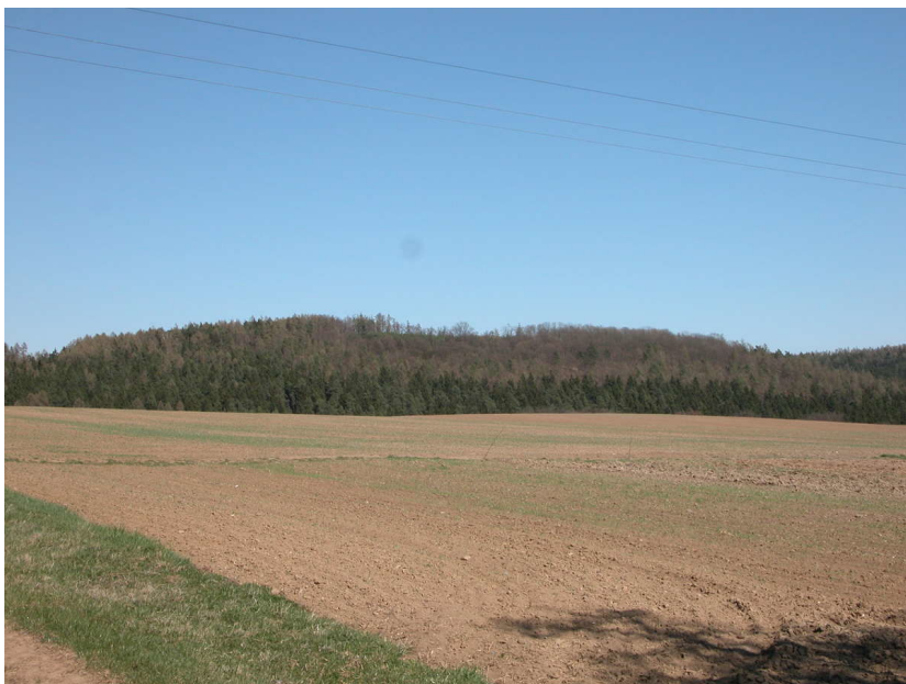
View of Rmíz from the west.