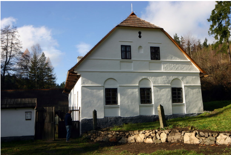
Front view of the relics of the former mill.