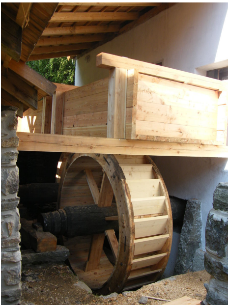
Overshot waterwheel, view from the south-west.