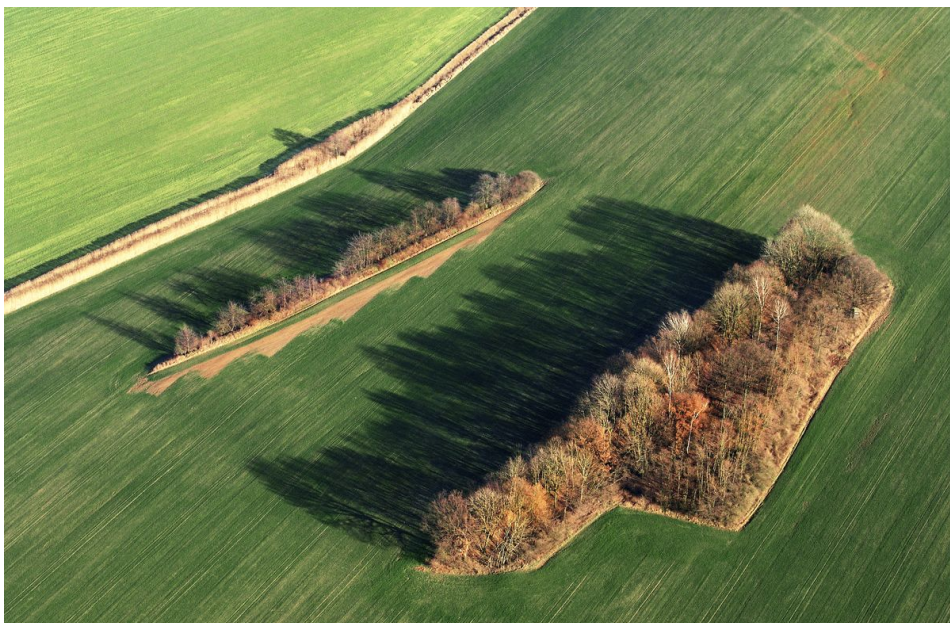
Aerial view of the quadrangular banks.