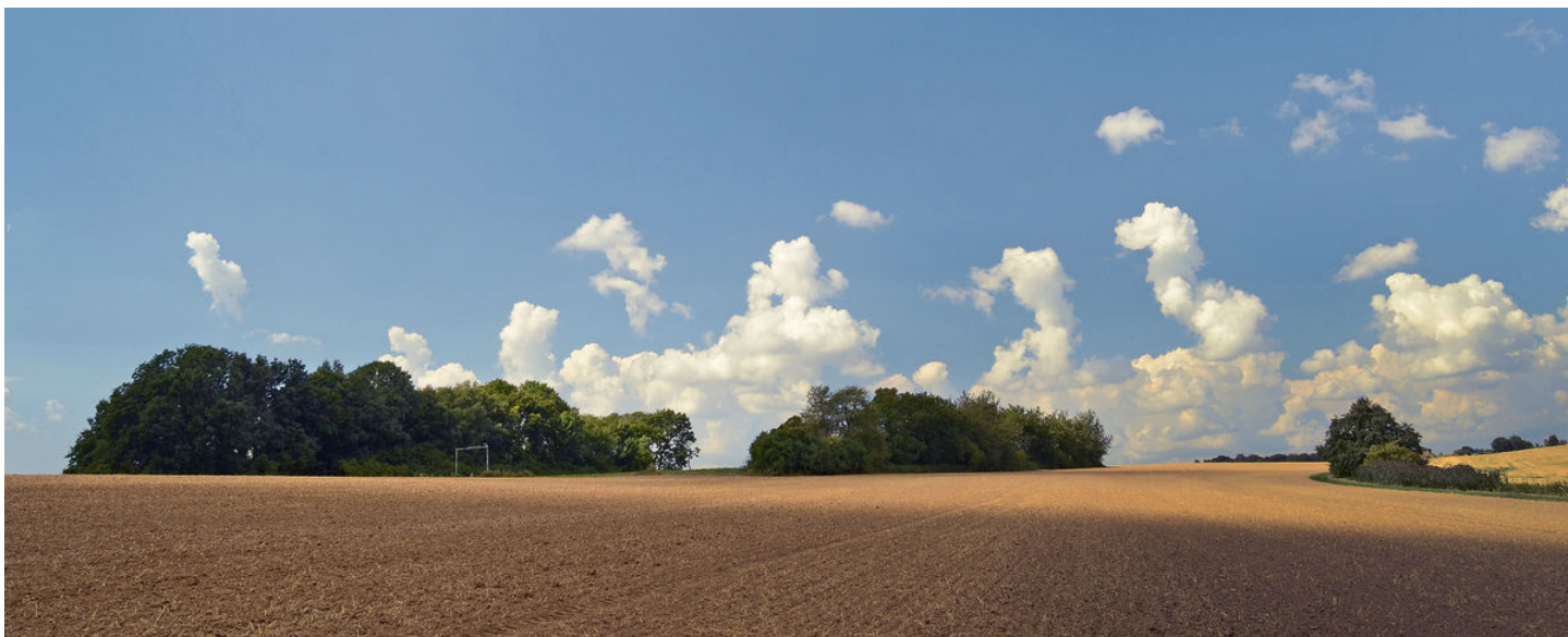
Both preserved lines of banks.