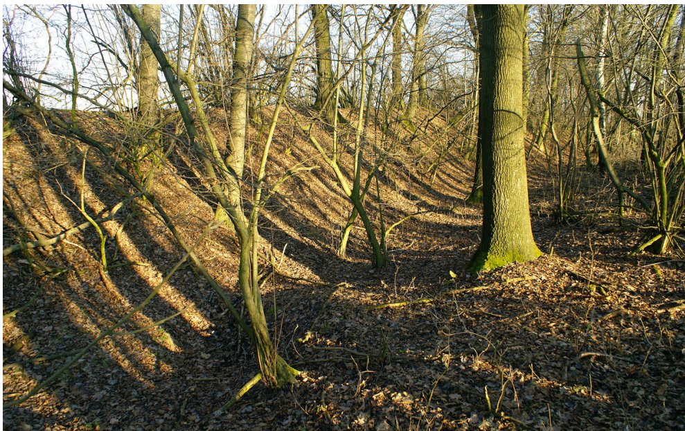
Bank on southern side of the area.