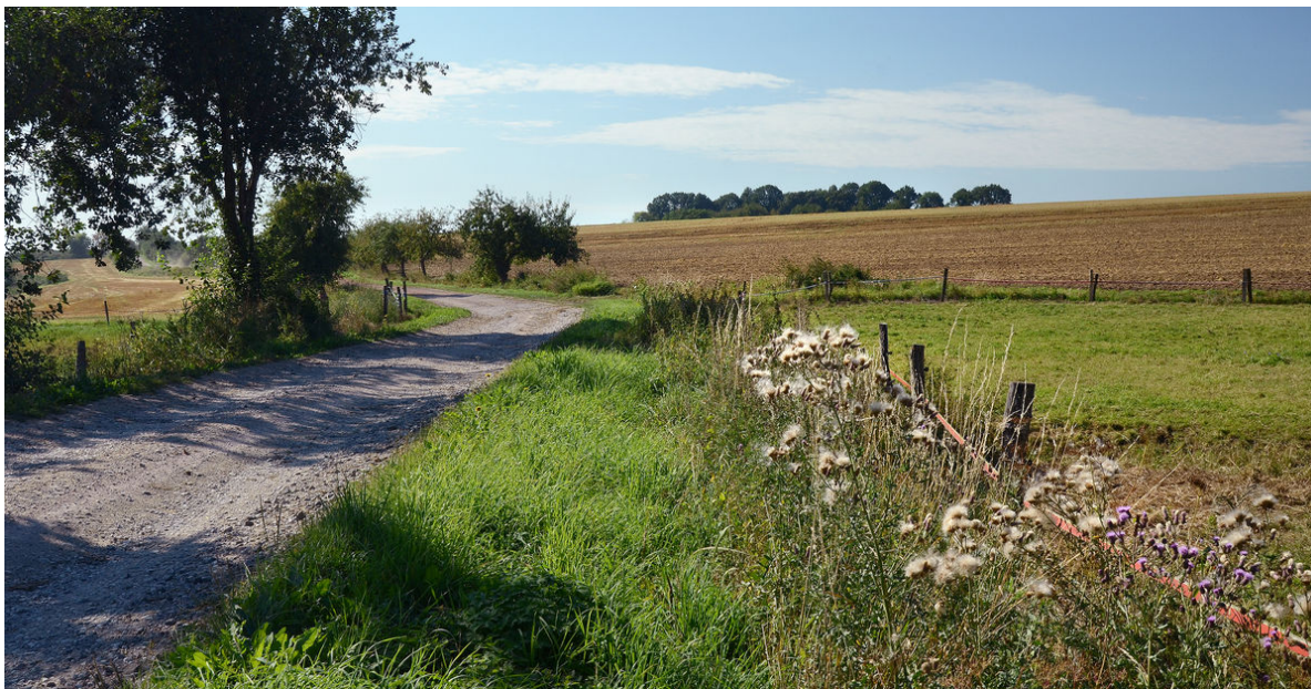
View on the banks from a unpaved road.