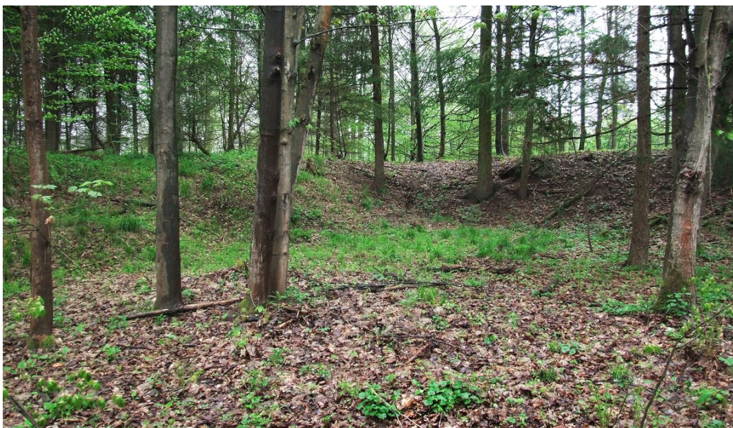
Traces of siege works in the castle's foreground.