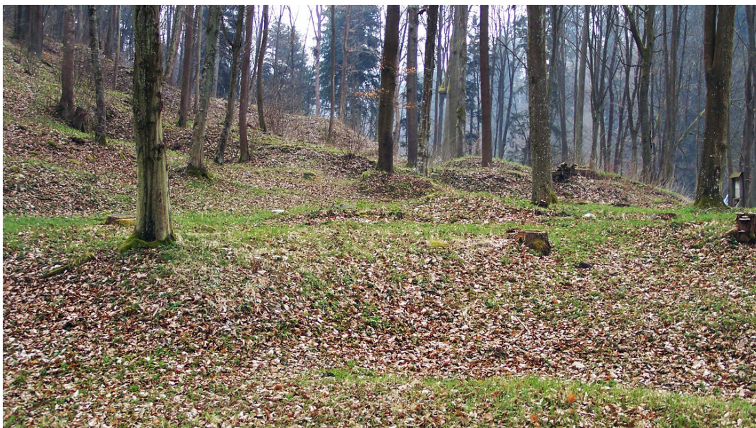
Bailey with a deserted hollow way.