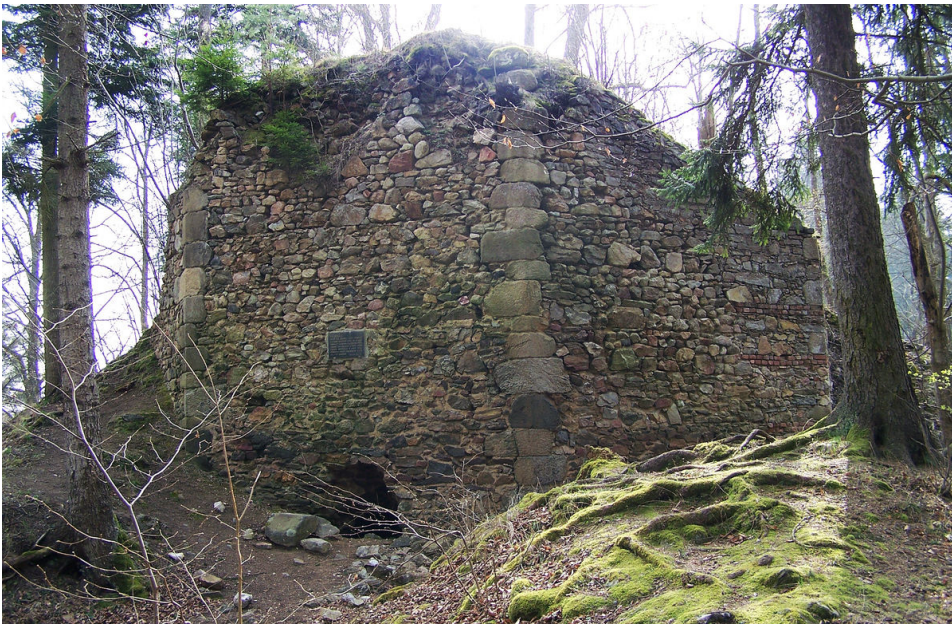
Remains of a bergfrit.