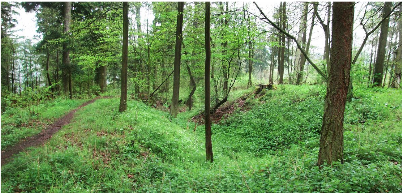
A hollow way leading from the first gateway to the castle's core.