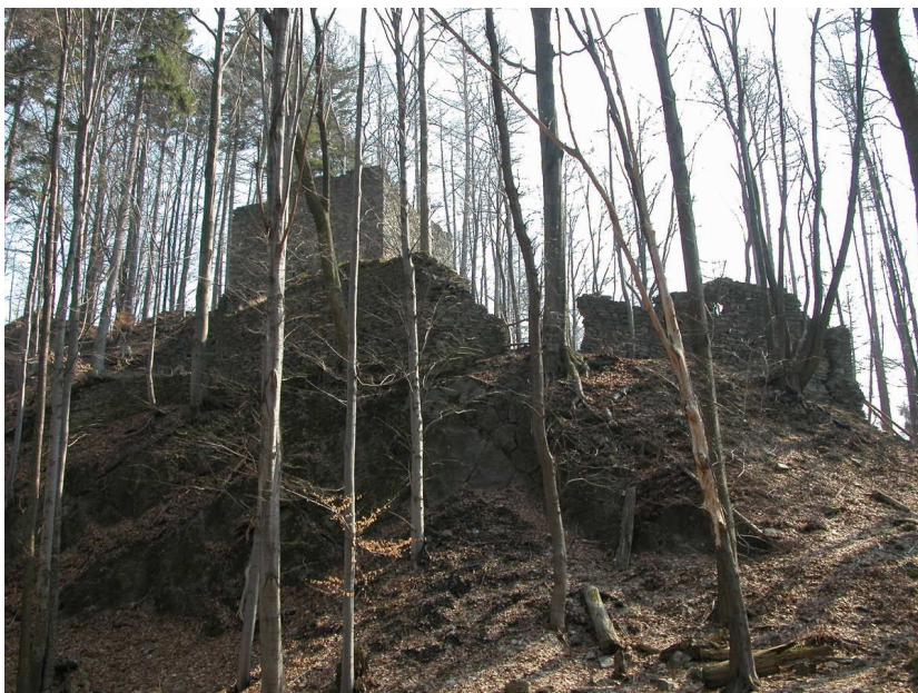
Overall view of the upper ward from the west.