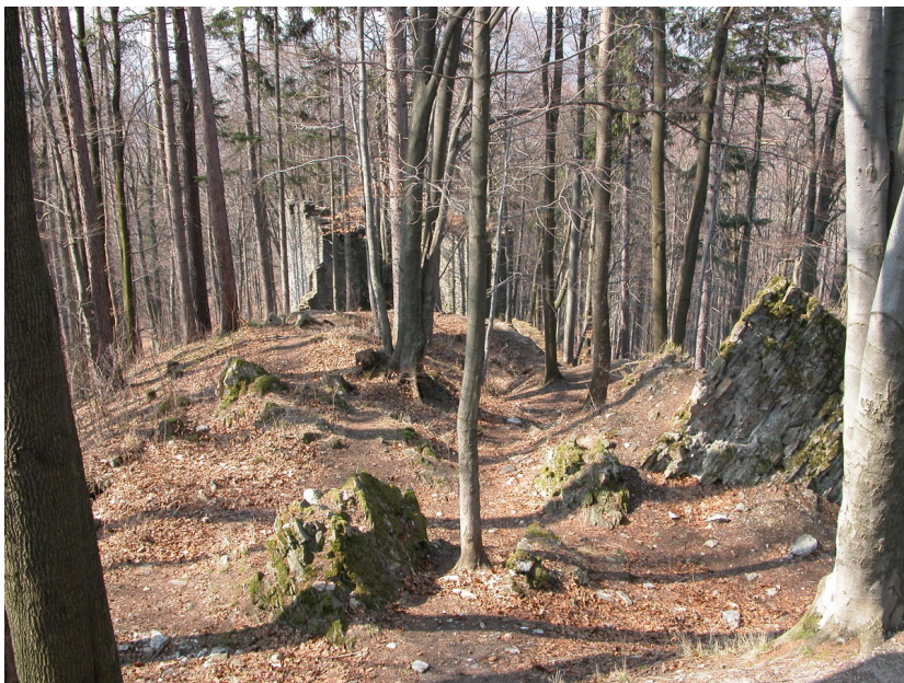
Upper ward from the east, stone blocks of the tower walls in the foreground.