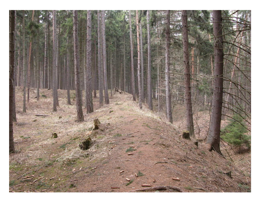
Earthwork and V-shaped ditch on the north part of the sconce; view from the east.