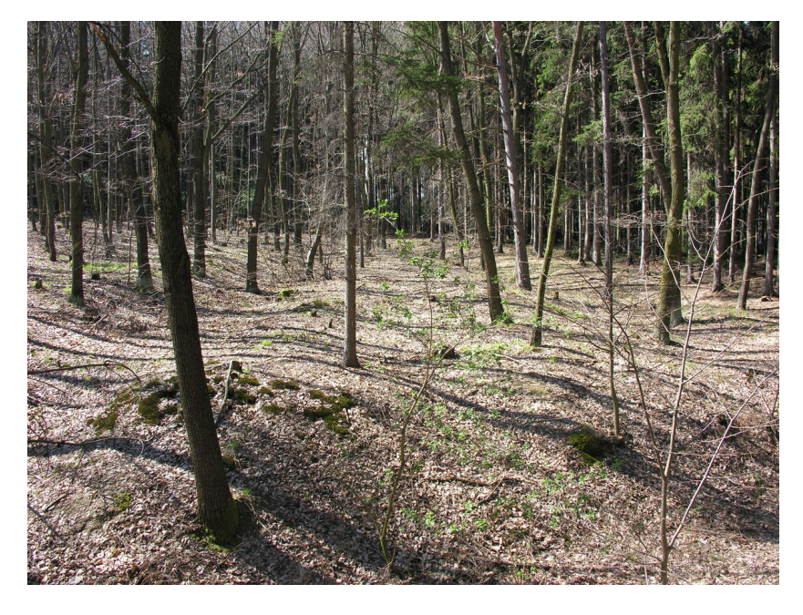
Remains of hollow ways in the south-eastern part of the inner area of the sconces, seen from the south-east.