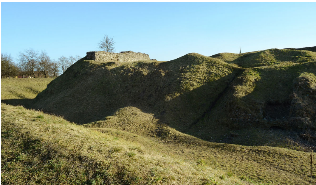
Castle core with a moat.