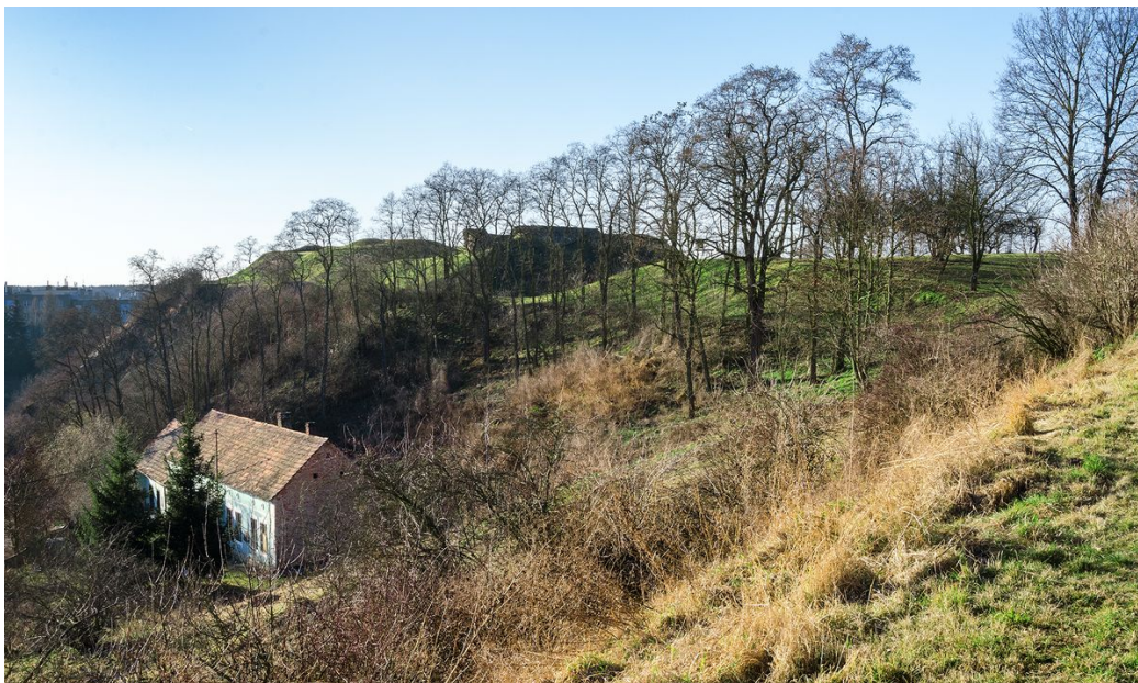
Castle, taken from south-east.