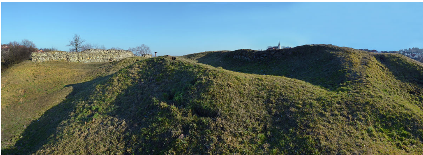
Ruins of the castle core. Photo Z. Kačerová, 2014.