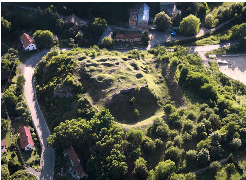
Aerial view of the castle.