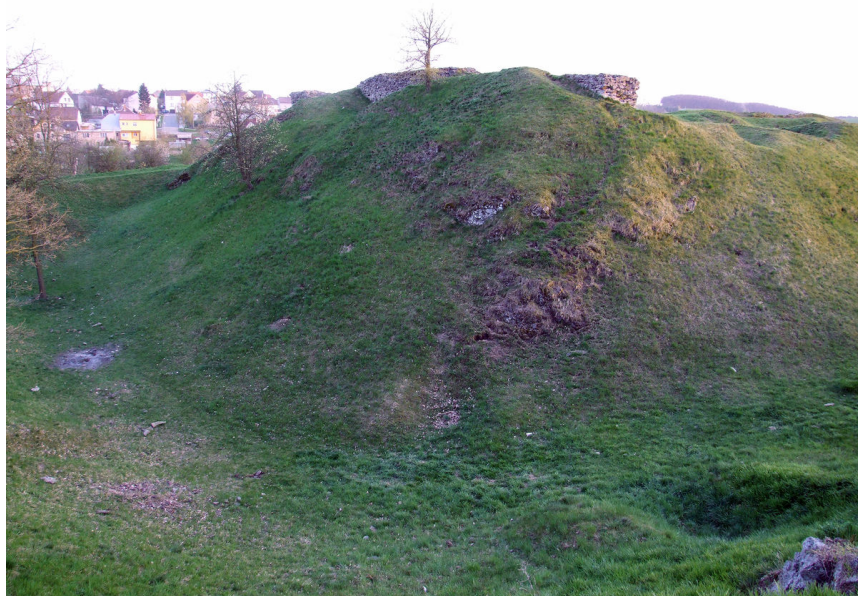
Ditch dividing the castle core from its bailey.