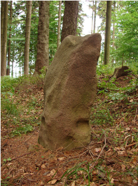
Erected stone at the peak of the hillfort.