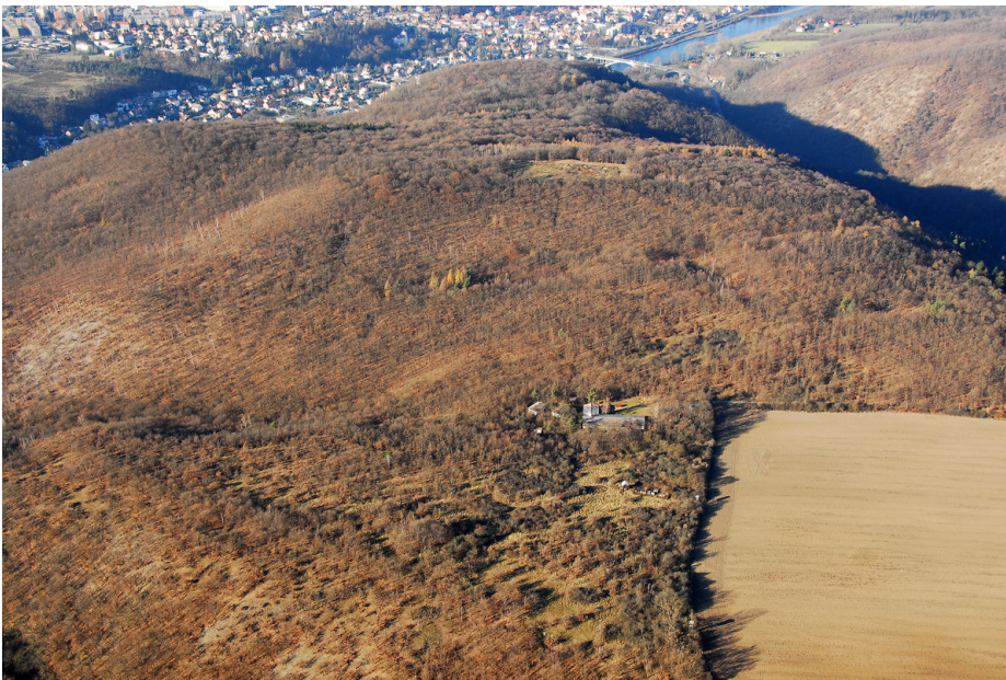
Aerial view of the site Hradiště nad Závistí.