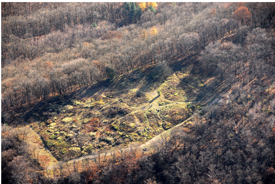
Aerial view of the acropolis.