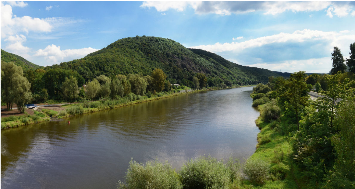
View of the hillfort, taken from the other Moldau River bank.