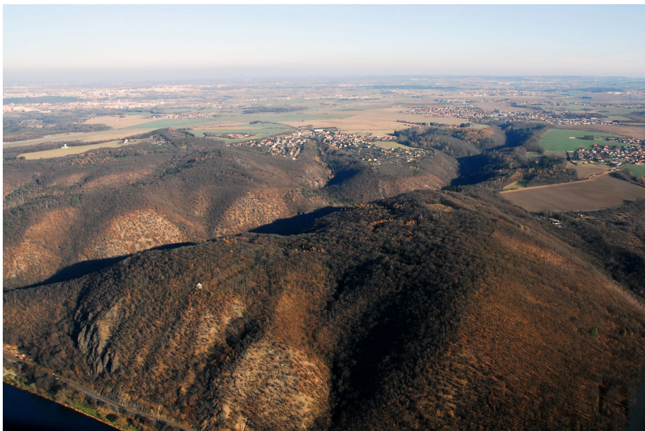
Aerial view of the oppidum, taken from southwest.