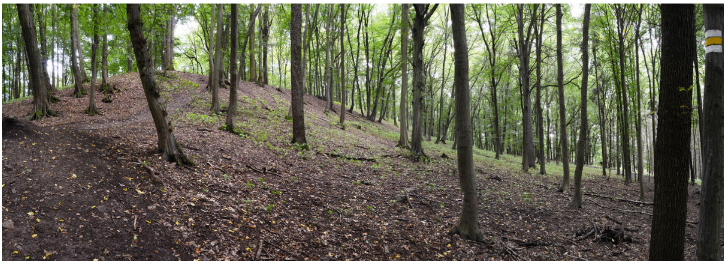
Path through one of the oppidum's inner banks.