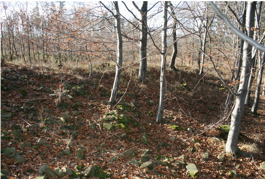
Disturbed rampart in the east part of the hillfort.