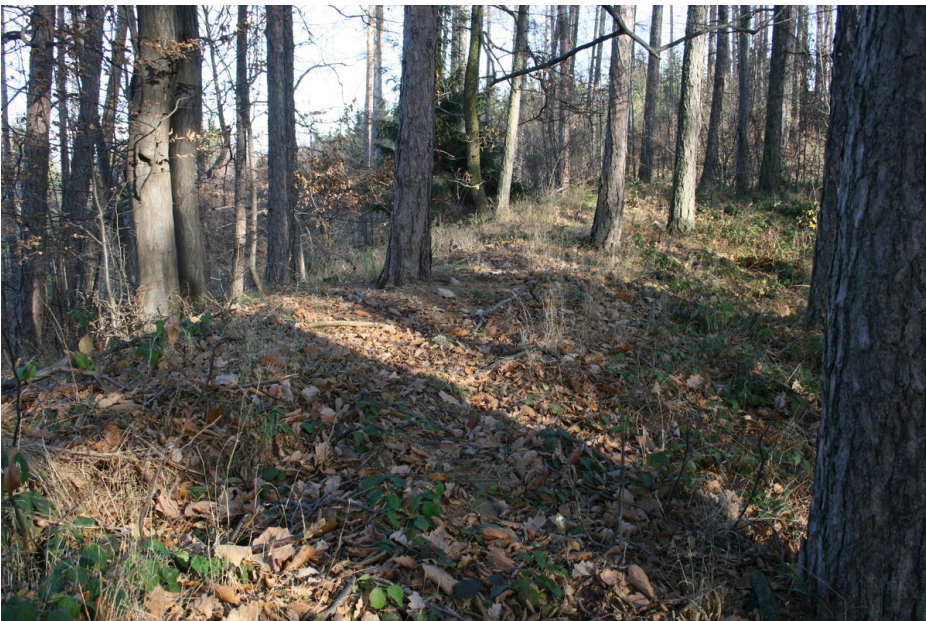
Remains of the rampart in the western part of the hillfort.