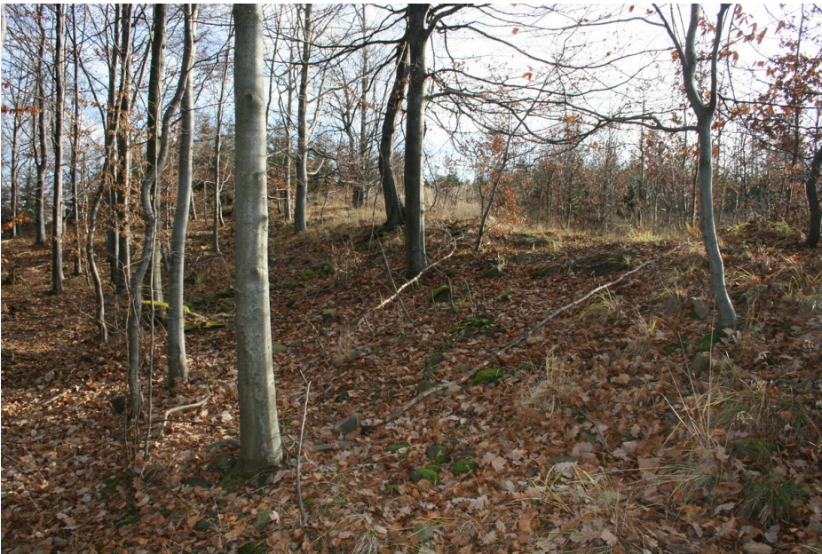
View of the earthwork in the eastern part of the hillfort.