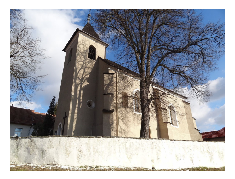
Church of St Martin. Photo A. Knechtová, 2015.