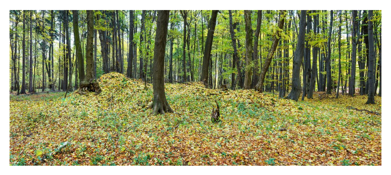
Two-storey construction to the west of the courtyard.