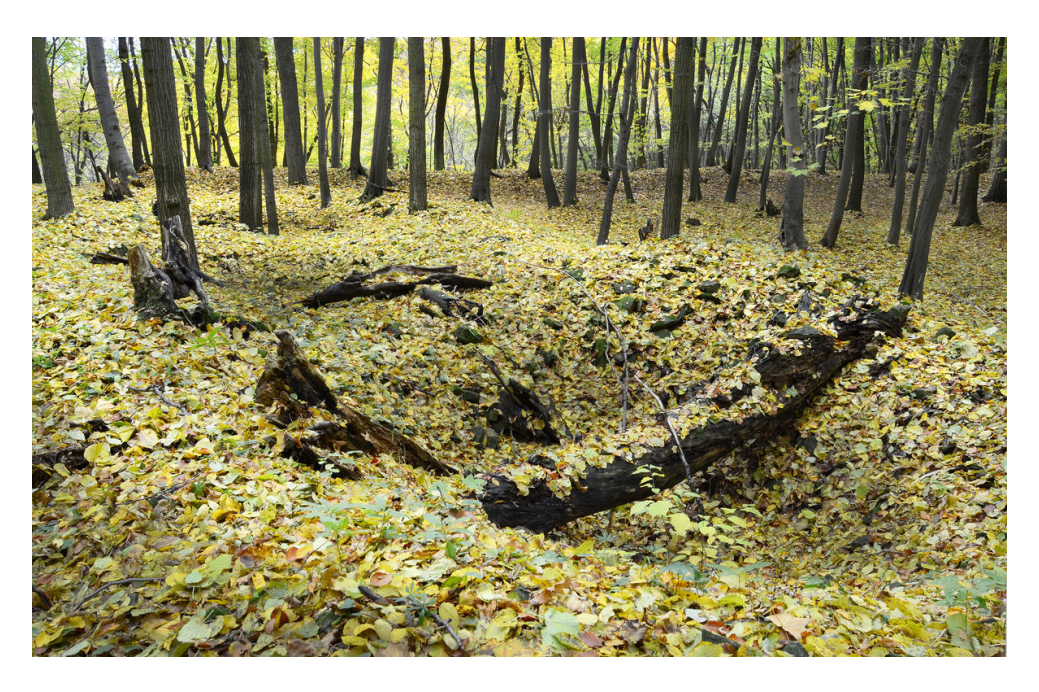
Semisunken part of a house.