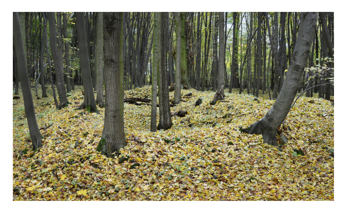
Tripartite house in the courtyard, taken from east.