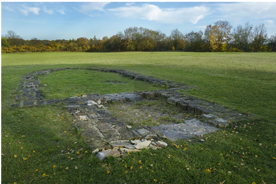
Groundplan of Our Lady church.