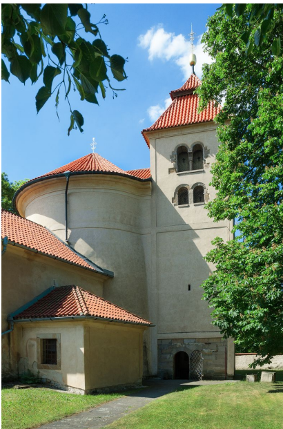
St Peter and Paul rotunda.