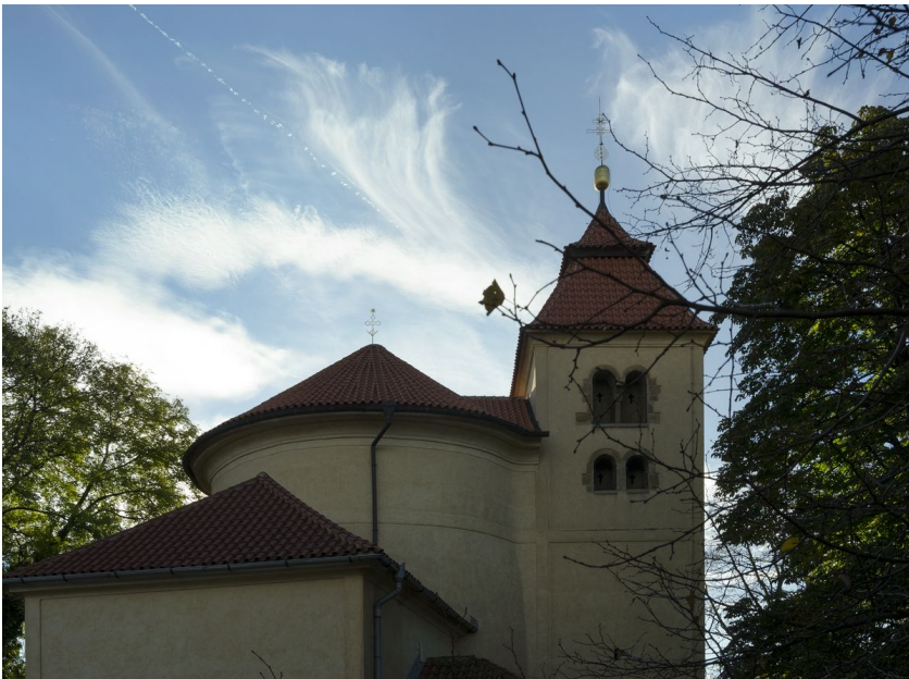
St Peter and Paul rotunda.