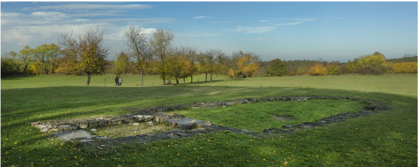
Groundplan of Our Lady church during excavations.