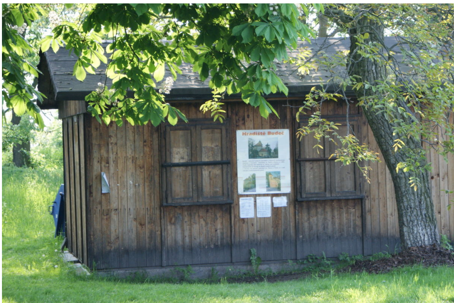
Wooden cabin used in 1980's during archaeological field work at the acropolis.