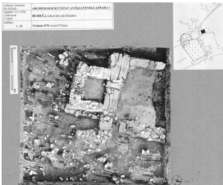
Photoplan of the Our Lady church during archaeological field work in 1976.

J. Morávek, 1976. Archives of the IoA, PY000430434.