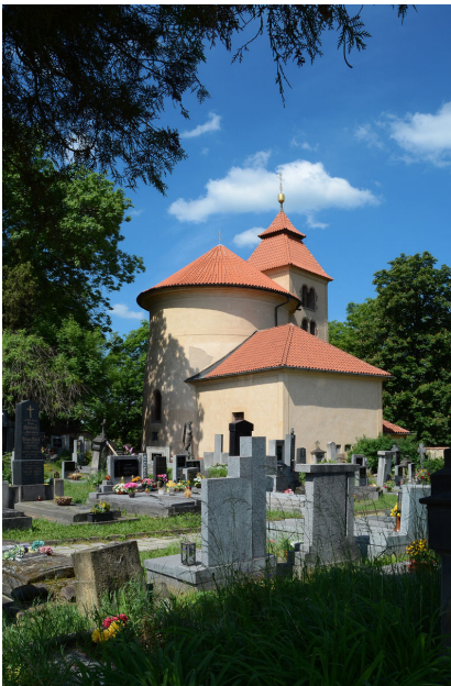
St Peter and Paul rotunda.