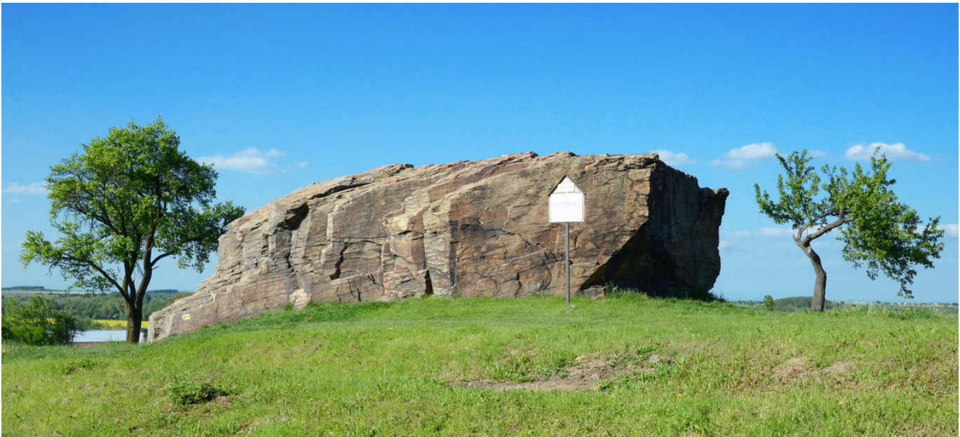
The so-called Lech's Stone in foregrounds of the Stará Kouřim hillfort.