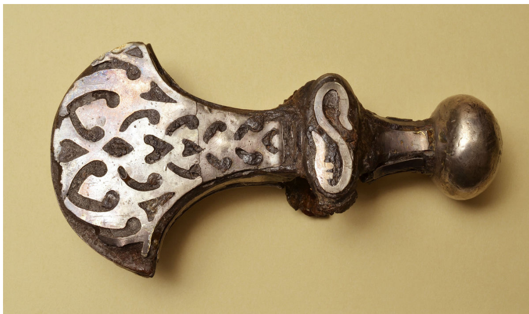
Battle-axe from one of the "Princely" graves discovered on the cemetery near Libuše Pond. NM collection, H1-96694. Photo L. Kachová, 2013.