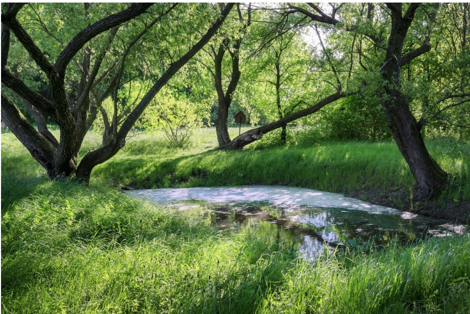
The so-called 'Libuše Pond' at the hillfort's arcopolis.