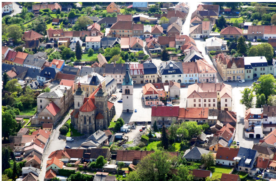
Aerial view of the city of Kouřim with the Basilica of St Stephen the Protomartyr. Photo M. Gojda, 2013.