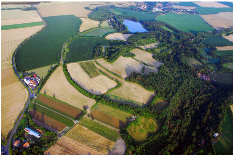
Aerial view of the hillfort Stará Kouřim.