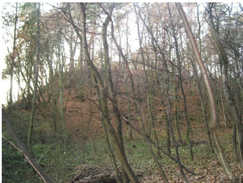
View of Melice Castle from the west.