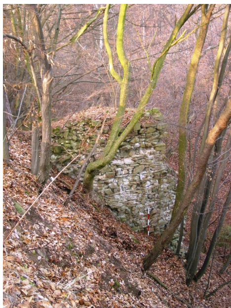
Outer buttress of the defence wall in the north-eastern part of the castle.