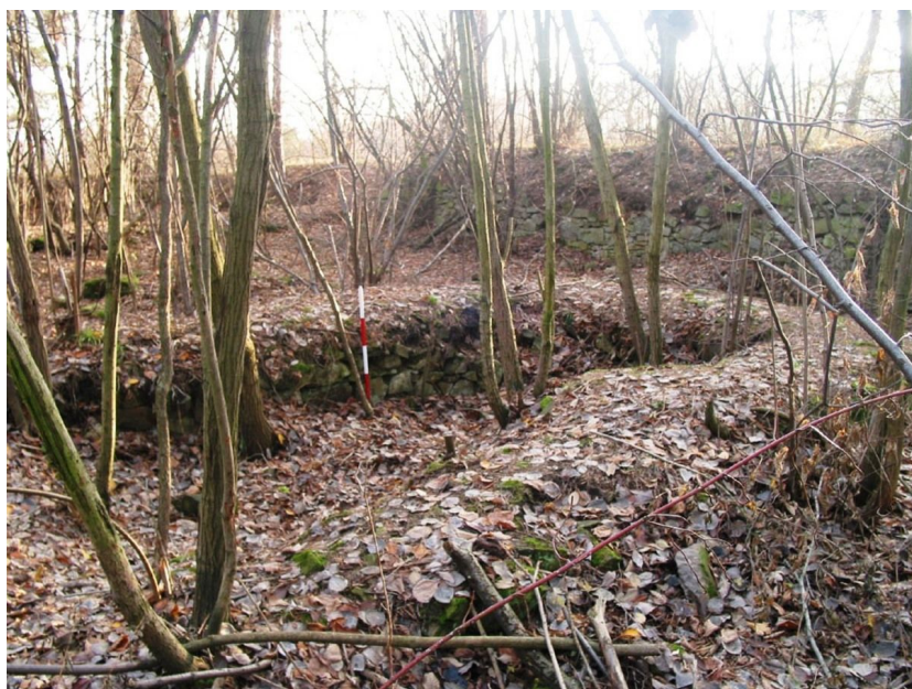
Ground plan of one of the preserved rooms of the west castle.