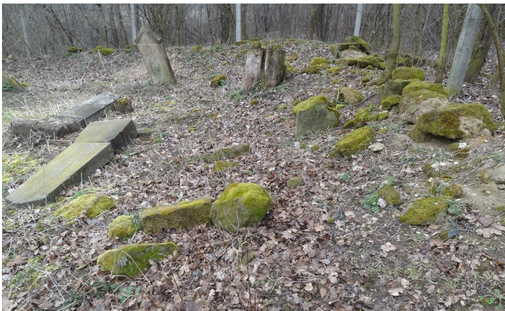
Stone debris from the graveyard wall.