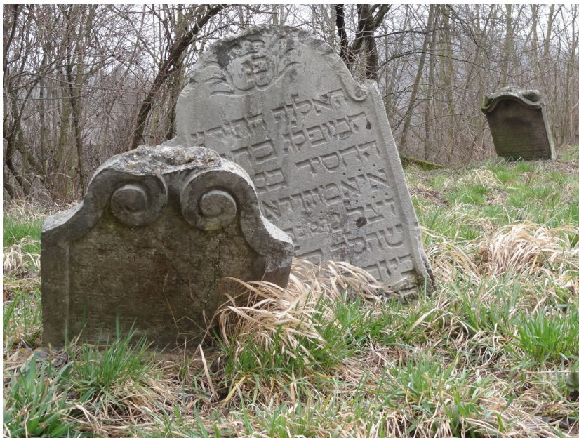
Grave stones with rich volute decoration.