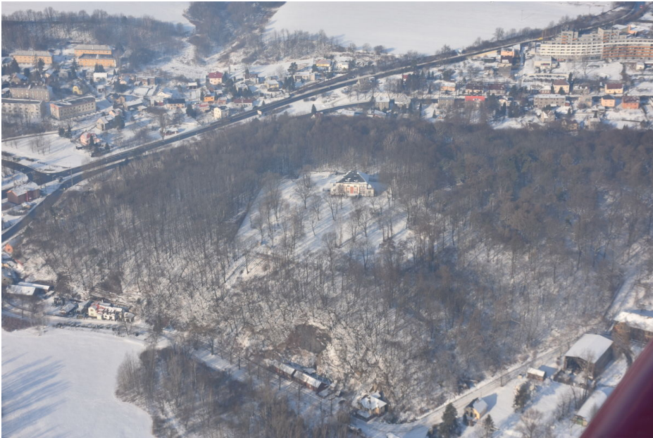
Aerial view of the eastern part of the mound.