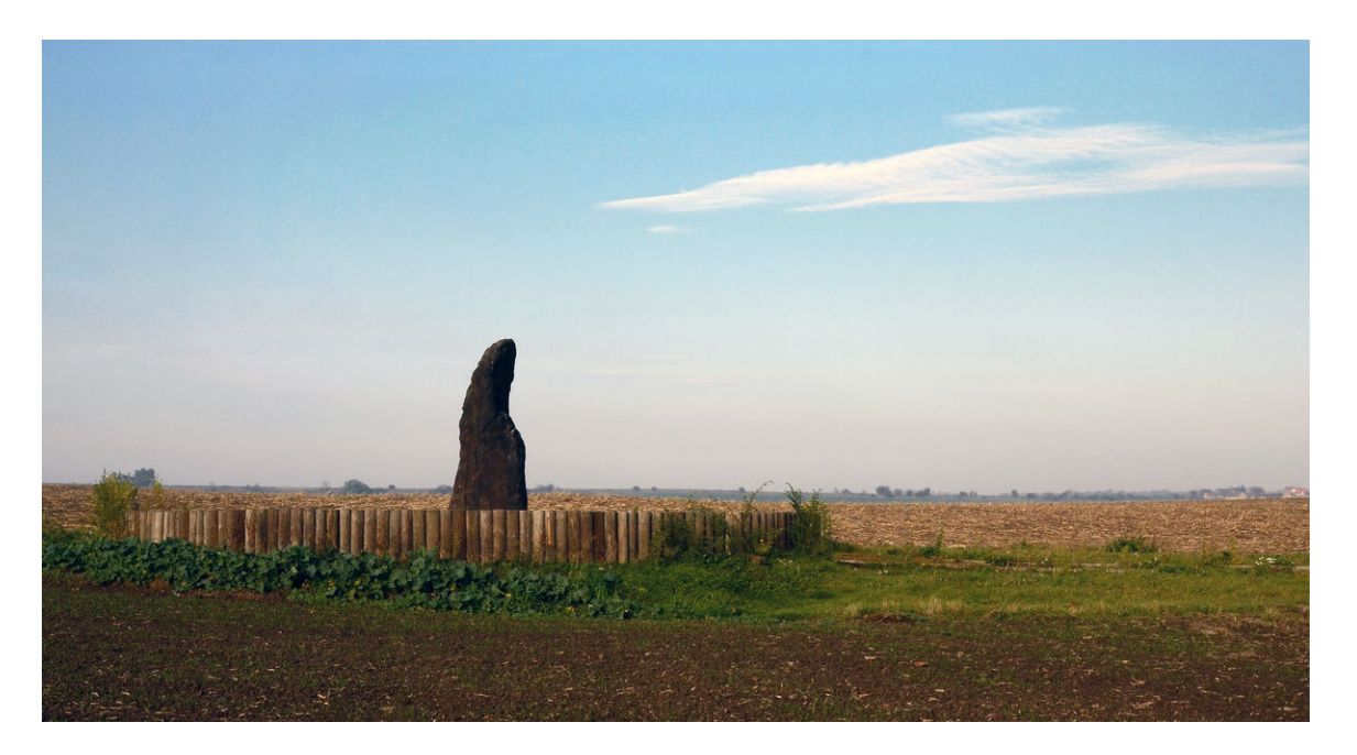
Menhir at Klobuky. Photo Z. Kačerová, 2013.