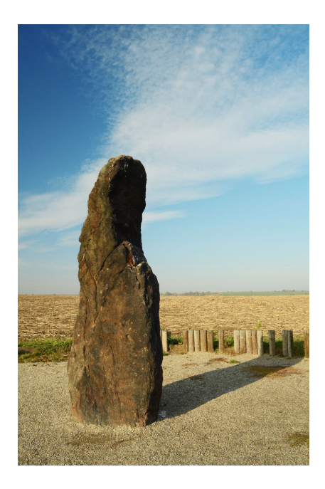
Menhir at Klobuky. Photo Z. Kačerová, 2013.