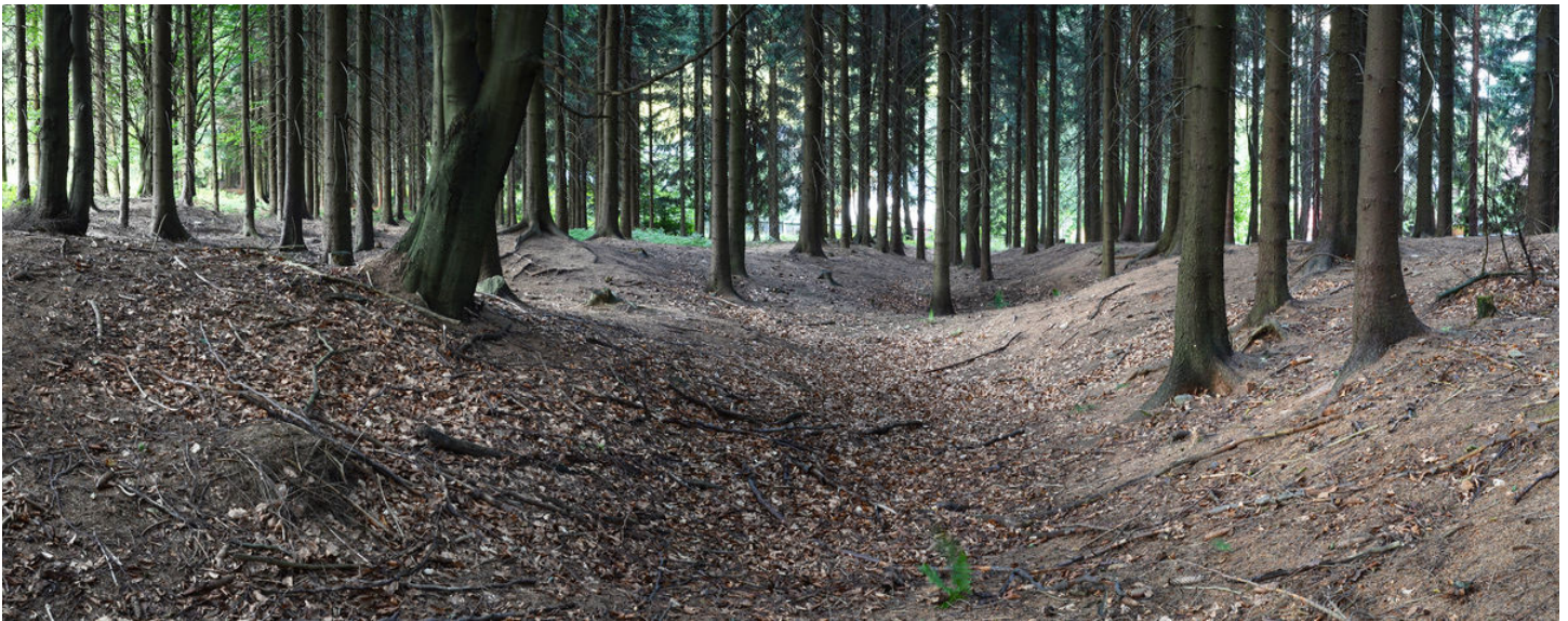
Traces of previous mining activities visible on the surface.