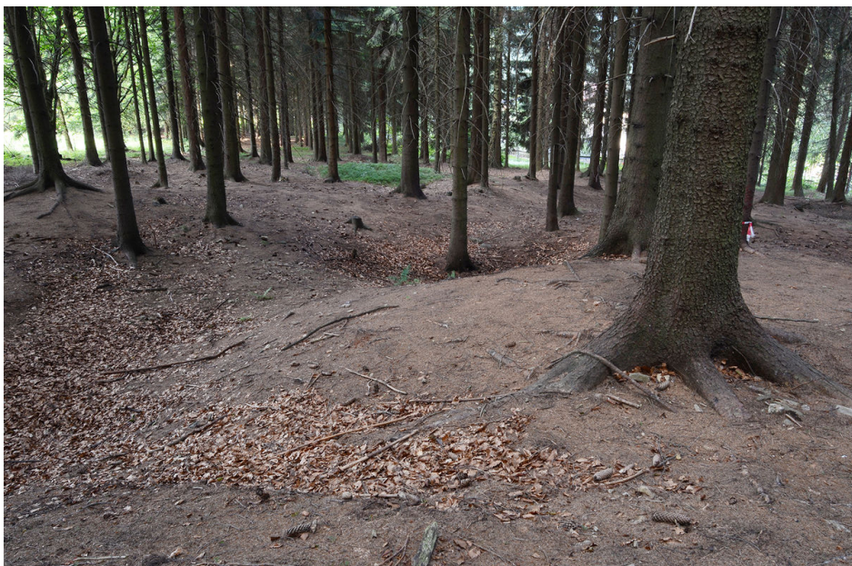
Former mining features.