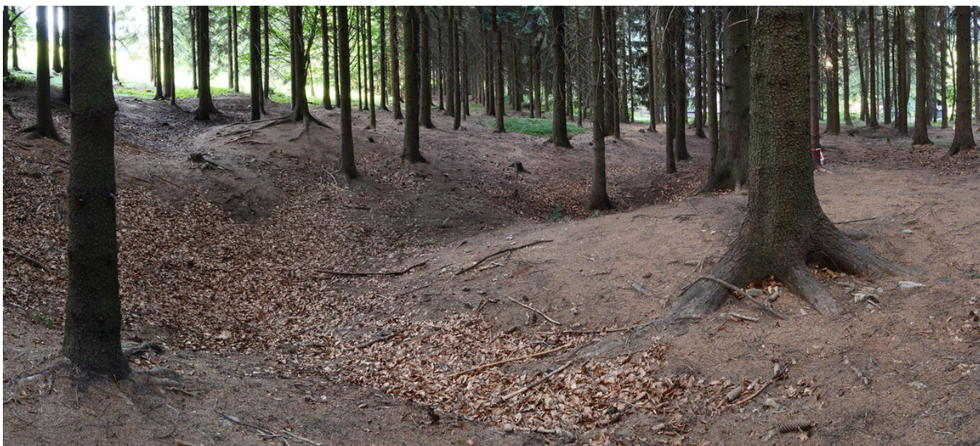
Mining surface relicts.