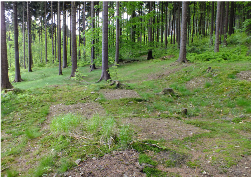
Location of P. Šída's excavations.