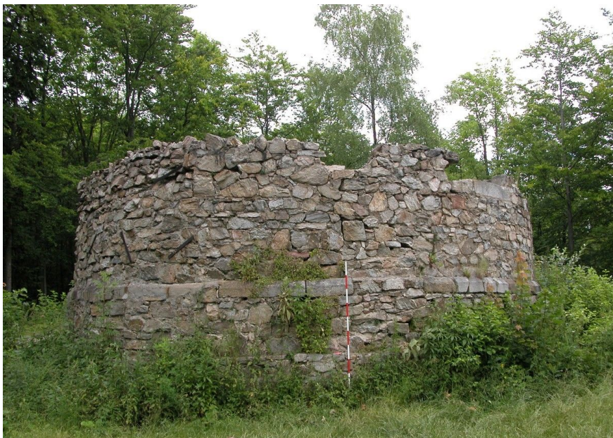
The bergfried from the south-west.