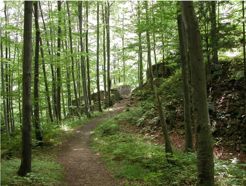
Access platform of the gatehouse.